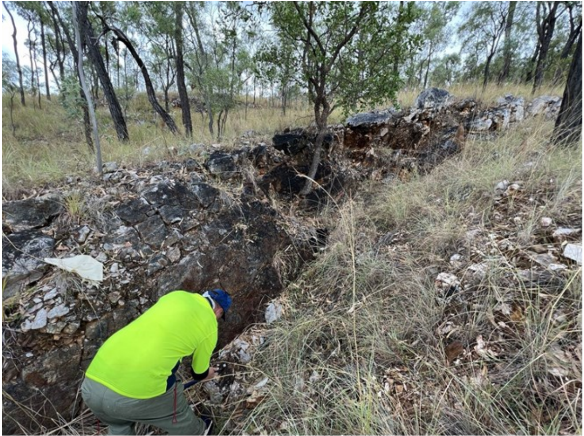
Photo 1 Photo Showing Sampling the Dividend Gully Pegmatite