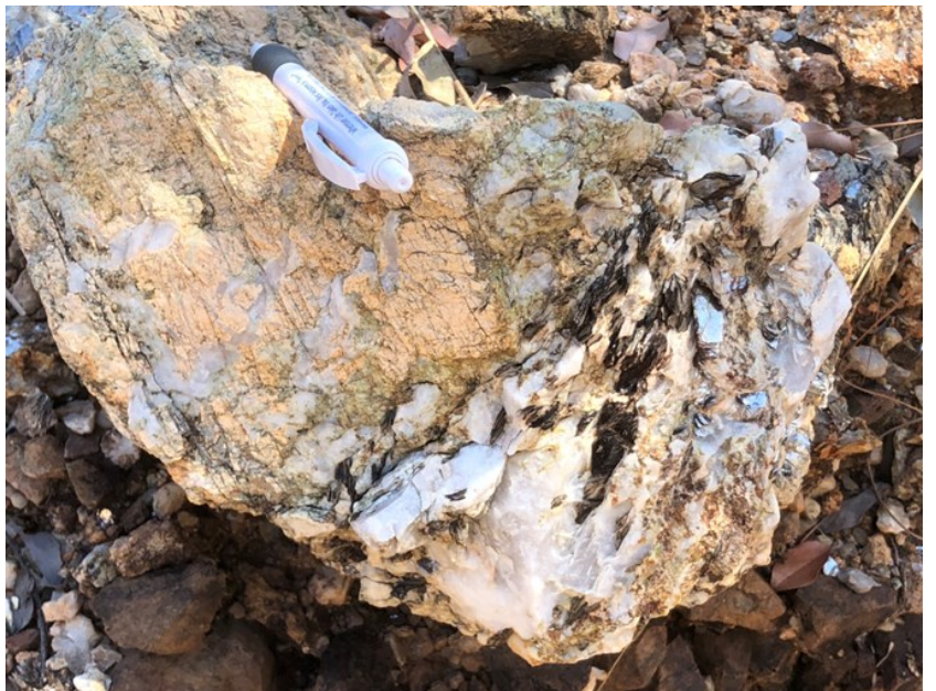
Photos 2 & 3 (above and left) showing the coarse grained muscovite pegmatites at Dividend Gully (Left) and Mountain Maid (Right) Prospects