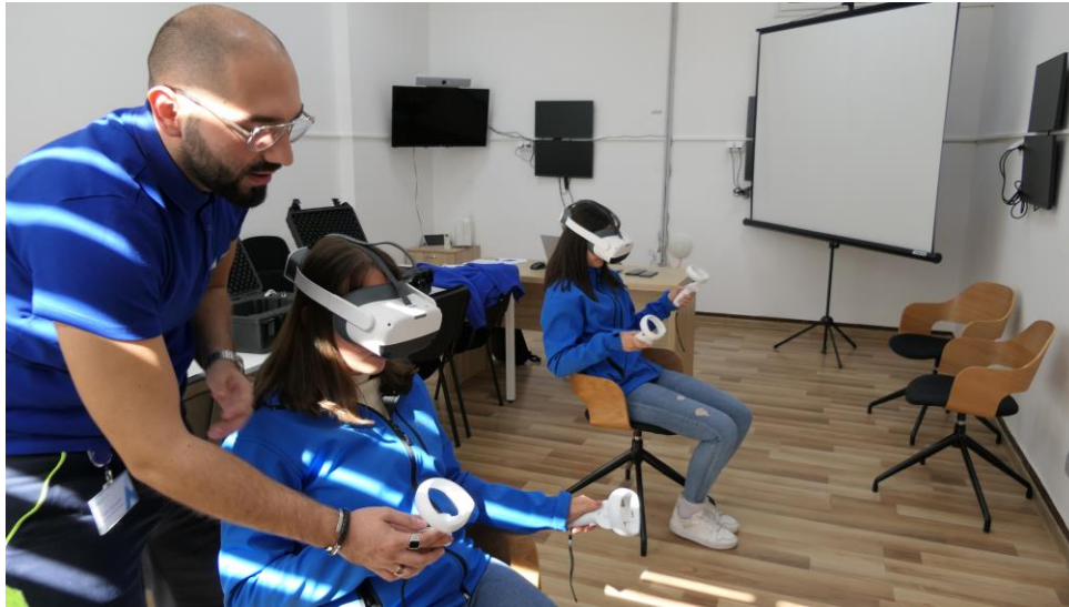
Figure 7: Virtual Reality H&S Training, Vares

Staff Short Term Incentive Payment targets have been universally adjusted to incentivise all staff to reduce incidents, and importantly report hazards and near misses, resulting in a dataset that will enable our team to identify behavioural attributes that contribute to both positive and negative health & safety outcomes.