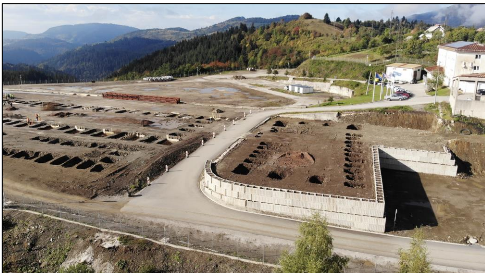
Figure 4: Vares Processing Plant (September 2022)

The contract for the design, supply and install of the processing buildings was awarded in June 2022, with the building foundations finished in September 2022. In the first week of October 2022 the installation of the steel columns commenced. The principal two process buildings (mill and flotation) are on schedule for completion in November 2022. All buildings remain on schedule for completion at the end of Q1 2023. The steel, wall panels and four overhead cranes have all been purchased, ahead of installation. Internal concrete construction and the installation of processing equipment will commence on schedule in November 2022.