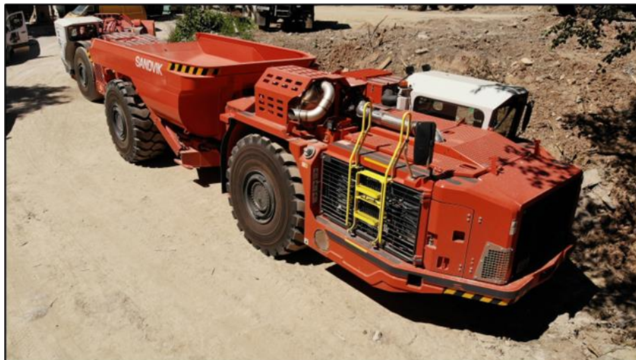
Figure 3: Sandvik Haul Truck TH545i

The temporary surface explosives magazine, which is required to support operations ahead of the permanent underground magazine incorporated into the main design, has been commissioned. Further, the Company is discussing with the Federal Mining Ministry for their approval to use non-gasified emulsion explosives. Non-gasified emulsion does not require storage in a dedicated magazine and therefore removes the requirement to develop a costly underground facility. The existing surface, temporary, magazine in this cost saving scenario can be utilised to store detonators. Non-gasified emulsion also provides better blasting efficiency and reduces blasting gases with the potential to proportionally decrease blasting cycle times.