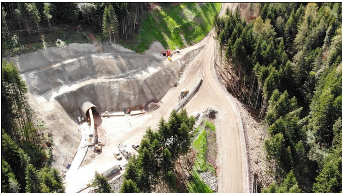
Figure 2: Lower Portal

The 5.5m x 5.5m upper decline is also advancing well, at 100m at the start of October 2022 (71m in September, averaging 2.4m per day). Similar to the lower decline, the ground conditions beyond the initial portal area are better than anticipated.