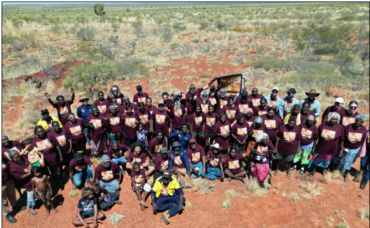
Figure 1. Signing Ceremony

Agrimin Limited (ASX: AMN) ("Agrimin" or "the Company") is pleased to advise that it has signed a Native Title Agreement with Parna Ngururrpa (Aboriginal Corporation) RNTBC ("PNAC"), the native title representative body for the Ngururrpa native title holders ( Figure 1 ). The Native Title Agreement provides the necessary consents for a Miscellaneous Licence to be granted to Agrimin by the Department of Mines, Industry Regulation & Safety.