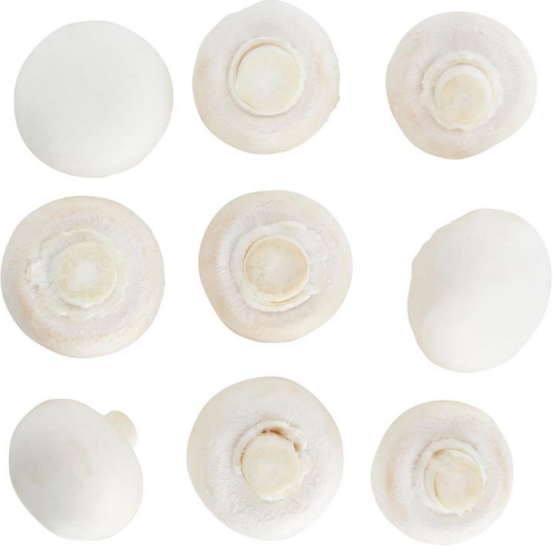
Cup – 35-60mm