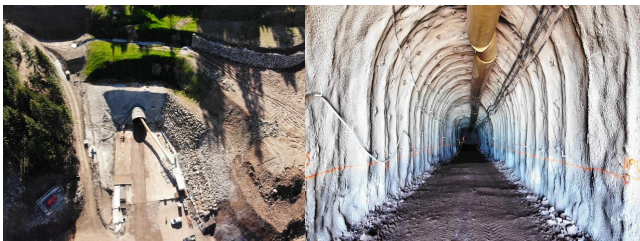
Figure 2: Upper Decline Portal and Underground Development

The Company remains on schedule to open its first stopes in Q2 2023, three months before commissioning of the Vares Processing Plant.