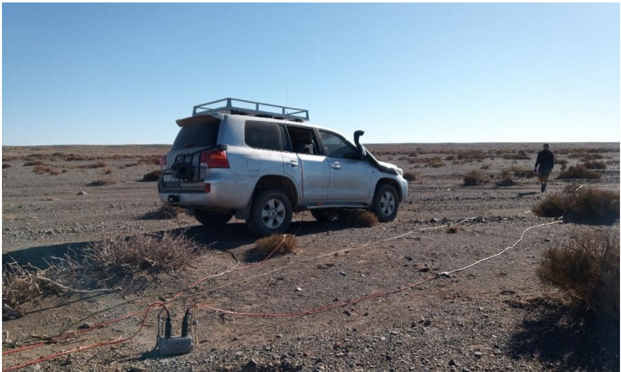
Figure 2 – Gurvantes XXXV Project, 2022 Seismic Survey in Progress