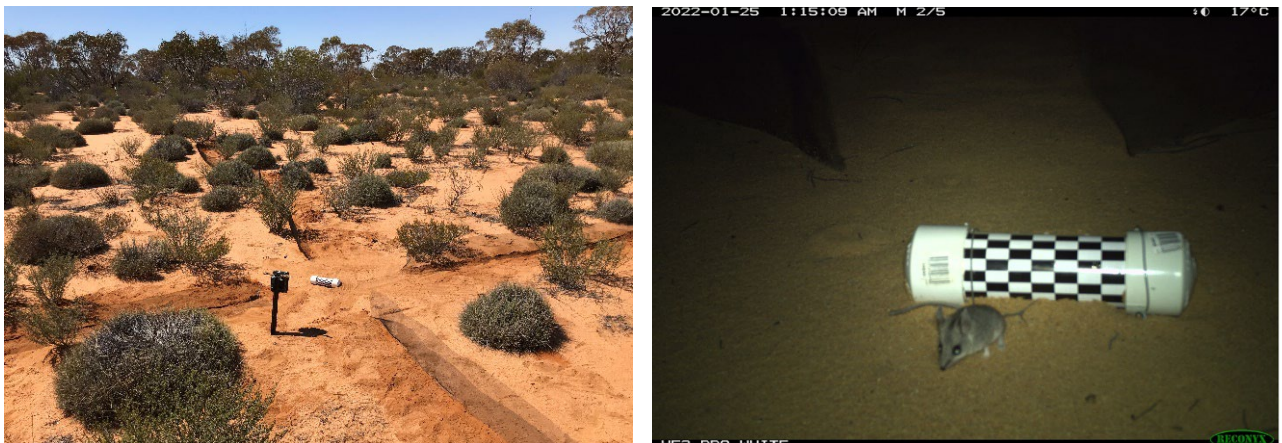
Figure 2: Site layout and Sandhill Dunnart captured on camera at Site 17B (25 January 2022).

Results from the study identified numerous positive sightings of the Sandhill Dunnart marsupials and found to occur over a large portion of the SDCP defined area, all pointing to existence of a robust Sandhill Dunnart population across the survey area.