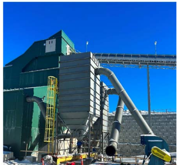
3 rd ore sorter chutes, conveyer and feeder (left); dust collection installation (right)