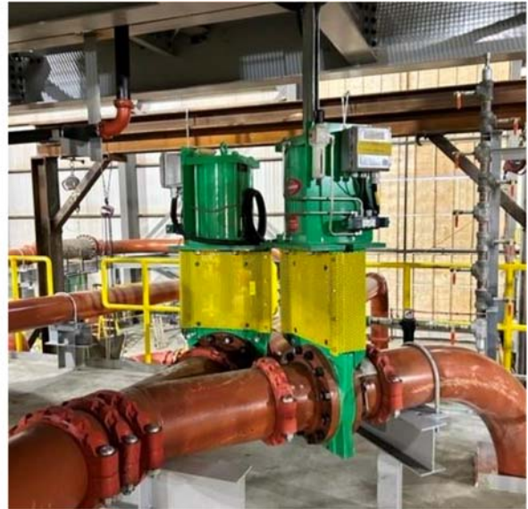
WHIMS rubber-lined piping installation (left); gate valves (right)