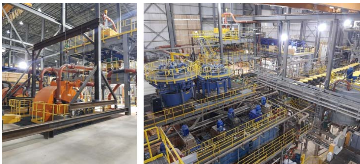
New WHIMS (left) and desliming sector (right)

"With lithium demand continuing to rise and supply limited, NAL is in an excellent position to benefit as we move towards becoming North America's leading integrated lithium producer."