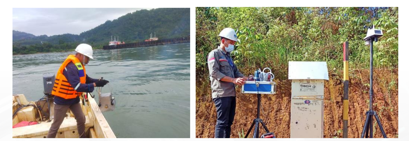
Water sampling and dust monitoring across Hengjaya Mines operations areas