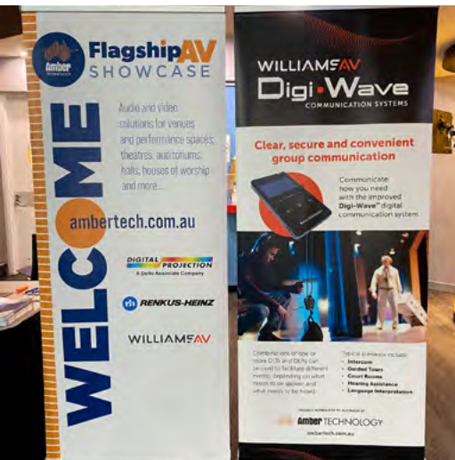
Flagship AV Showcase