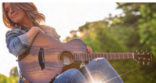
Breedlove ECO Collection