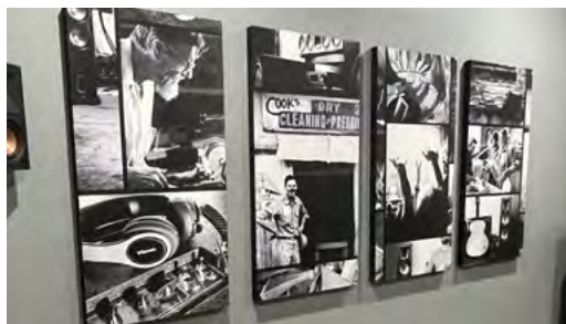
West Coast HiFi Joondalup