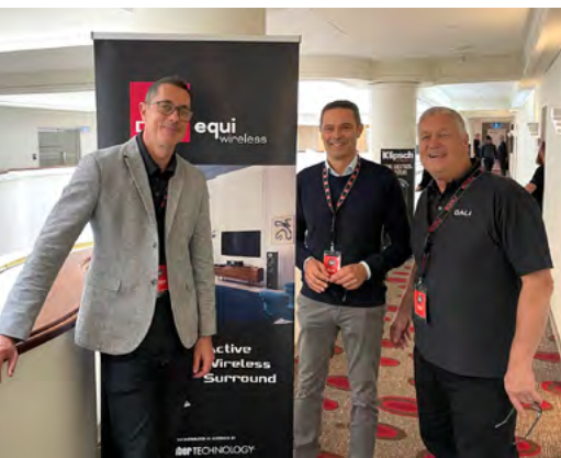
Hi - Fi SHOW