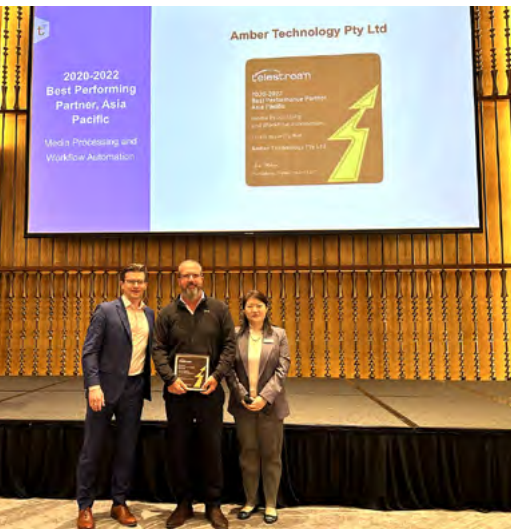
Telestream Partner Awards 2020 – 2022