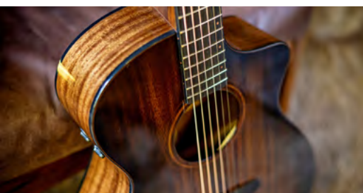
Breedlove Organic Pro Collection