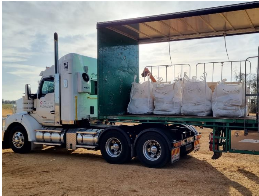
Figure 3 – Goschen Central in-fill drilling samples loaded for transport to Perth