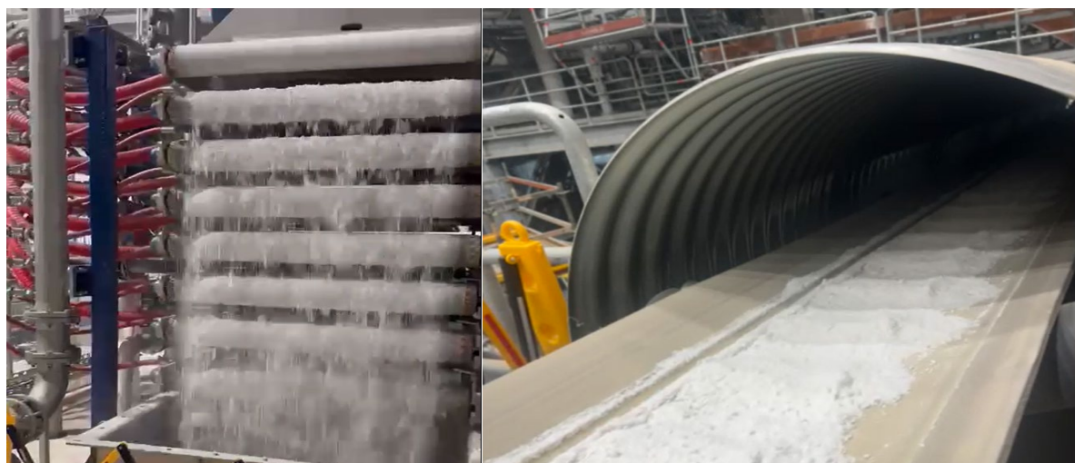
Figure 1: First production achieved at Olaroz Stage 2 – filter press and conveyor

Olaroz Stage 2 is intended to supply up to 9,500 tpa of technical grade lithium carbonate feedstock to the Company’s Naraha lithium hydroxide plant. The Naraha plant, which was recently commissioned in Japan, is owned in joint venture between Allkem and TTC.