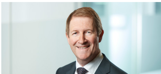
ROBERT COLE CHAIR