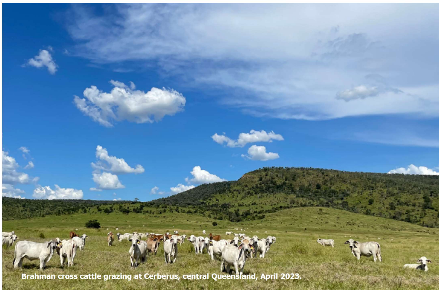
Brahman cross cattle grazing at Cerberus, central Queensland, April 2023.

Boardroom, the Fund's registry service provider, provides the option for Unitholders to receive their communications electronically. The Responsible Entity encourages all investors to communicate electronically and provides regular correspondence advising shareholders of this option.