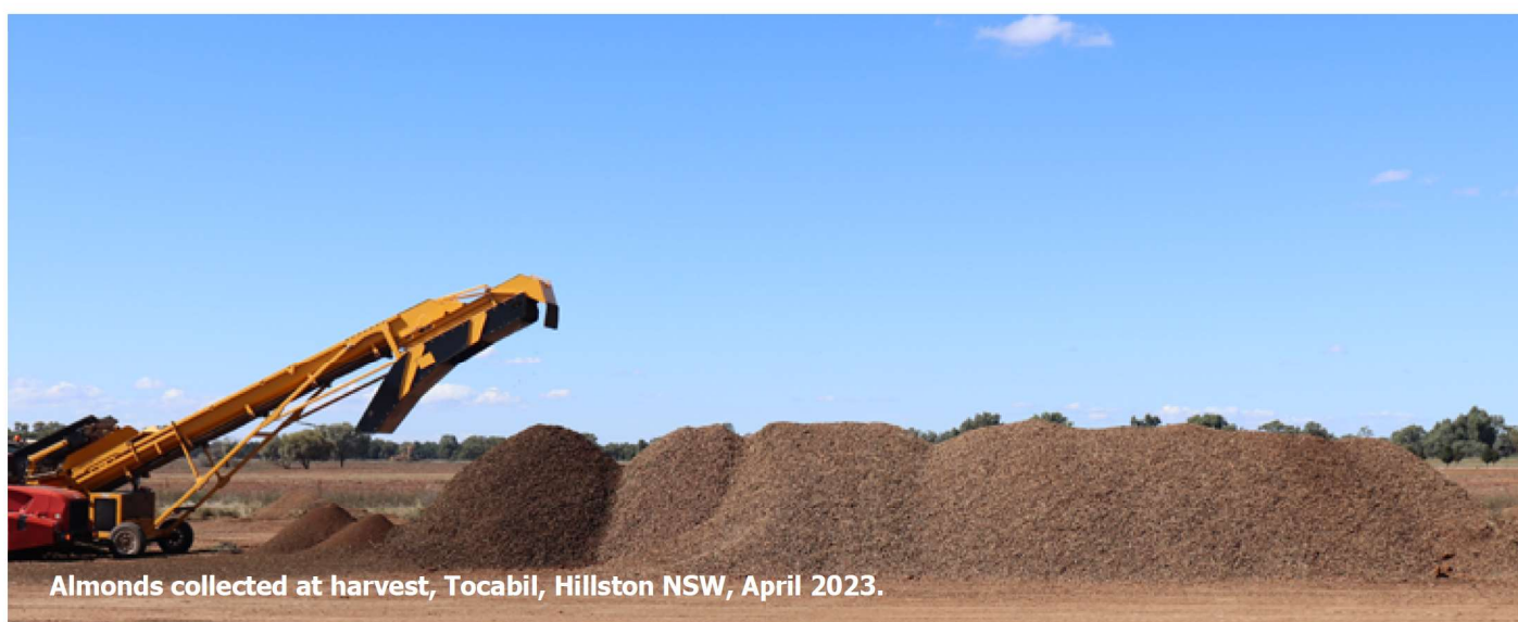
Almonds collected at harvest, Tocabil, Hillston NSW, April 2023.

New Directors are selected and appointed in accordance with the Corporate Governance Charter. New Directors are provided with an induction relevant to the Responsible Entity and the Fund and are provided opportunities to extend their skills and knowledge, through informal and formal means.