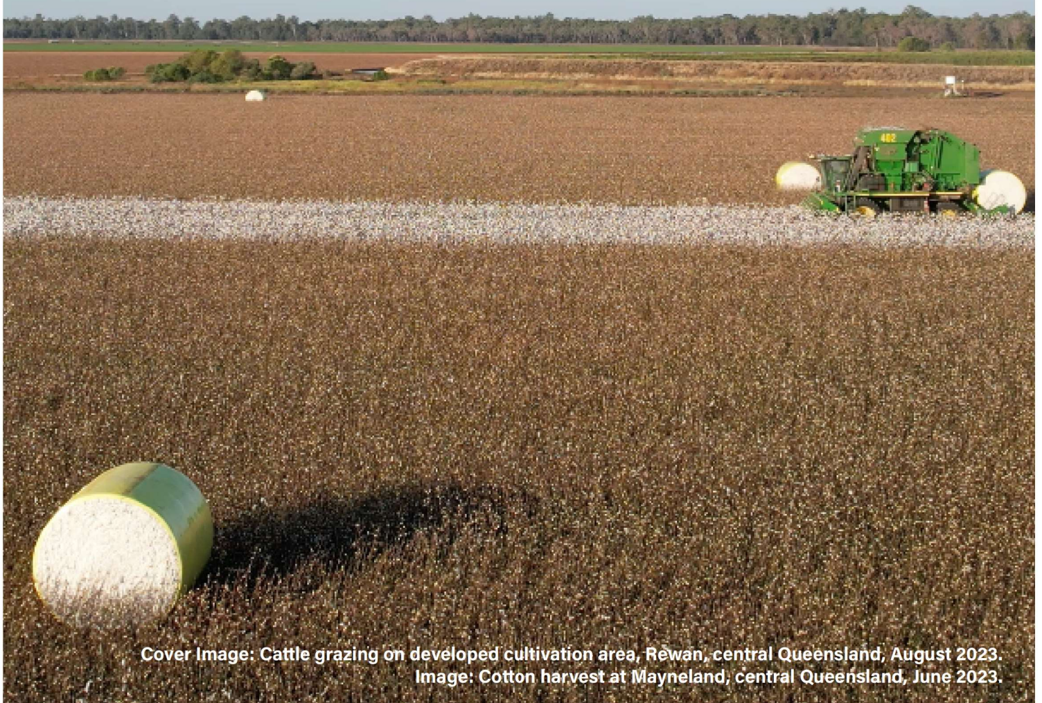
Cover Image: Cattle grazing on developed cultivation area, Rewan, central Queensland, August 2023. Image: Cotton harvest at Mayneland, central Queensland, June 2023.

Copies of the Responsible Entity's corporate governance policies are located on the Responsible Entity's website at www.ruralfunds.com.au .