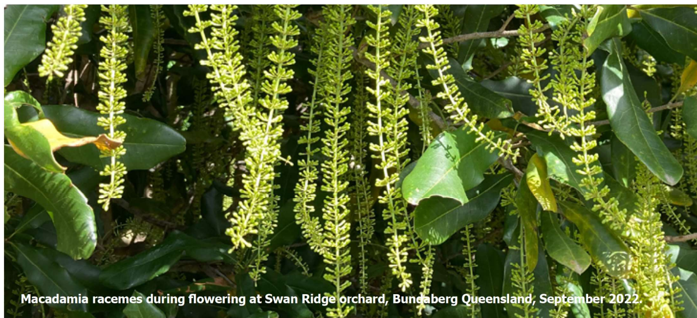
Macadamia racemes during flowering at Swan Ridge orchard, Bundaberg Queensland, September 2022.

The Audit Committee Charter, included in the Corporate Governance Charter, is available on the Responsible Entity's website.