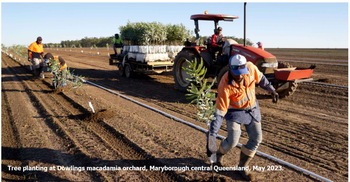
Tree planting at Dowlings macadamia orchard, Maryborough central Queensland, May 2023.

The Responsible Entity's approach to managing material exposures is outlined in the RFF Annual Report 2023 www.ruralfunds.com.au/investments/rural-funds-group/publications . Management of environmental (including climate-related impacts) and social risks are incorporated in the entity's risk management framework. The Board is responsible for overseeing the risk management framework, with the internal management of the framework delegated to the Internal Compliance Committee.