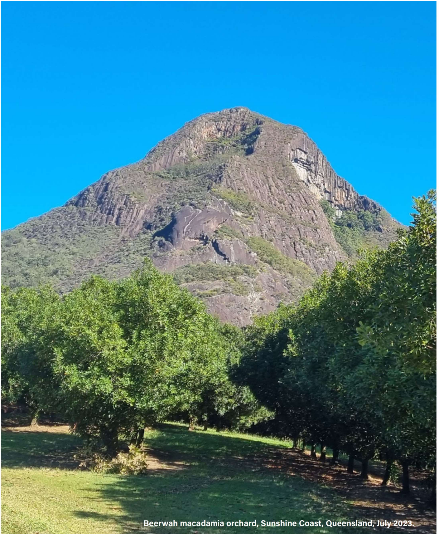
Beerwah macadamia orchard, Sunshine Coast, Queensland, July 2023.

The Corporate Governance Charter and Diversity Policy are available on the Responsible Entity's website.