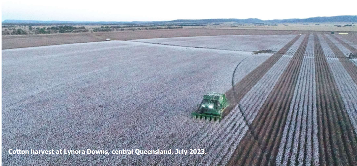
Cotton harvest at Lynora Downs, central Queensland, July 2023.

The Remuneration Committee's scope, responsibilities, and associated policies and procedures can be viewed at Corporate Governance Charter, located on the Corporate Governance page of the Responsible Entity's website.