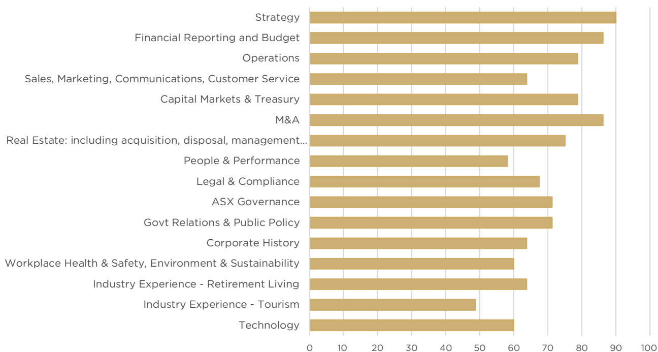
Board Skills Summary

Whilst the current Board composition meets the Group's needs, this skills and experience analysis will assist to identify opportunities for director training and development and to determine skills gaps that may be addressed through future Board appointments.