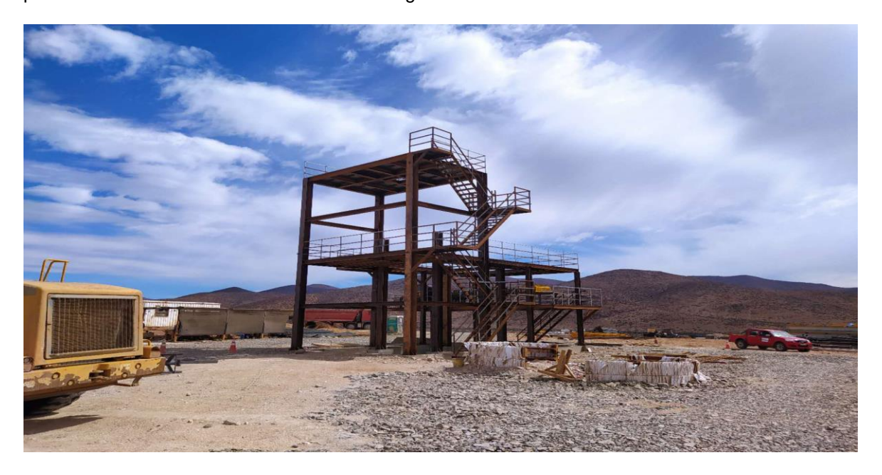
Figure 1: Screening platform and No. 3 belt conveyor

The installation of key equipment has progressed, with the construction of the screening platform and the installation of the No. 3 belt conveyor, which has been hoisted to the platform. A deep cone bottom platform has been installed and a fine crushing bin is under construction.