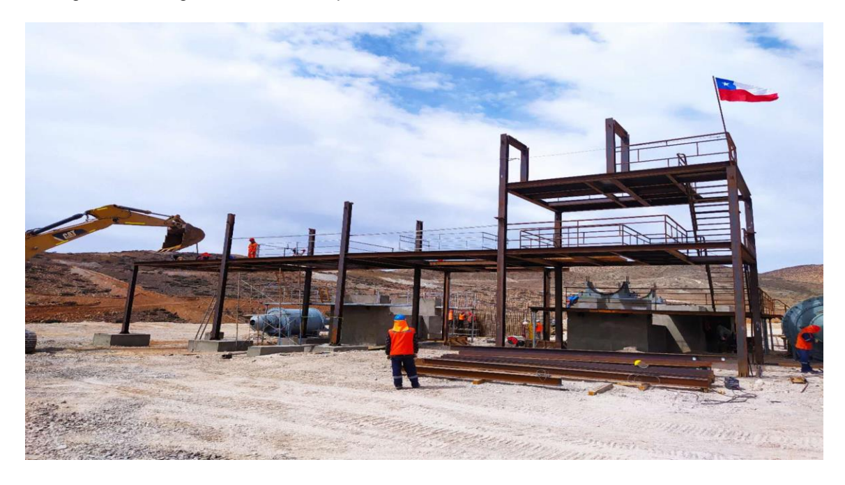
Figure 3: Installation of No. 1 and No. 2 ball mill operating platforms

Construction of the No. 1 and No. 2 ball mill operating platforms together with the calibration of the former was completed in August. Four magnetic separators and two cyclone platforms, with dimensions 24m long and 10m high, have been completed.