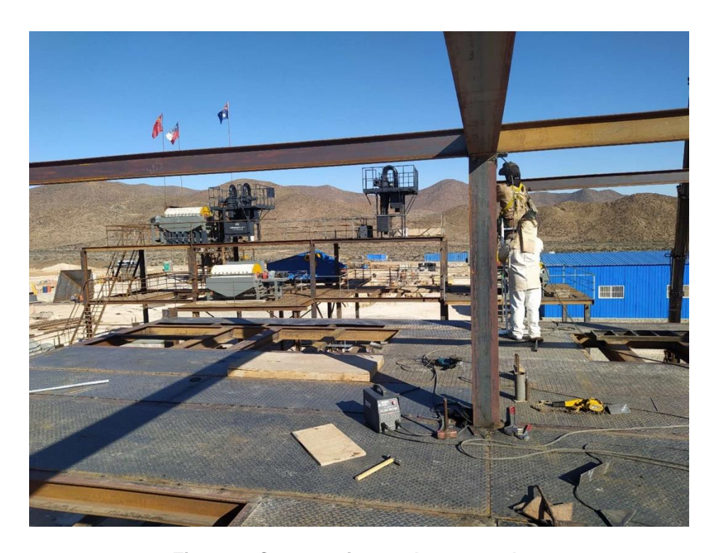
Figure 4: Construction work on new plant

The appointed contractors and civil engineers completed the platform foundation in front of the mill, together with the filter, fine crushing and deep cone foundations, while the No. 6 transporter is under construction. The filter's concrete retaining wall has been installed, together with the construction of the warehouse, canteen and laboratory.