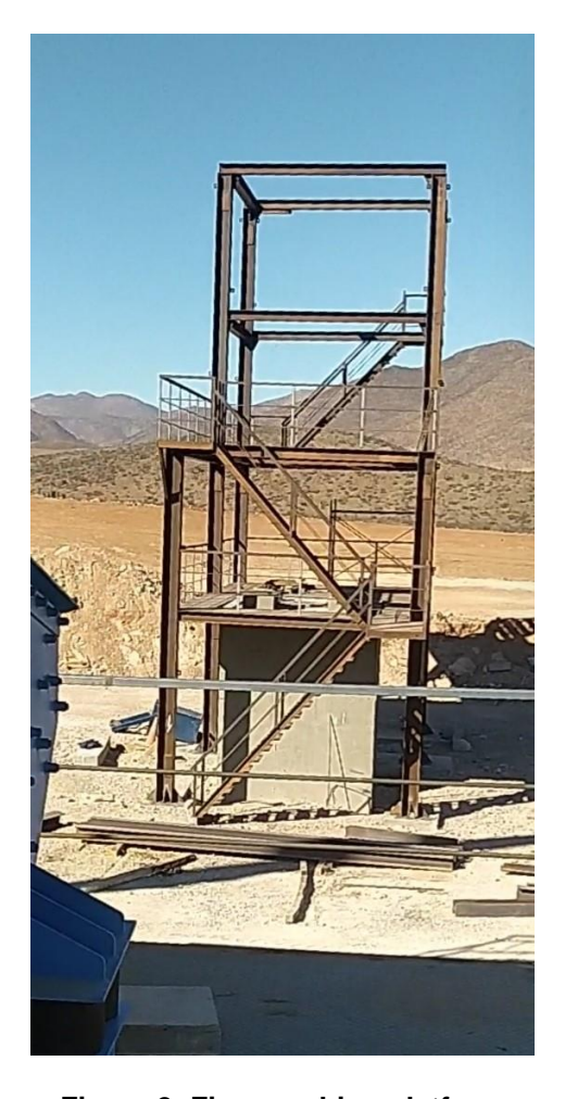
Figure 2: Fine crushing platform

Construction of the No. 1 and No. 2 ball mill operating platforms together with the calibration of the former was completed in August. Four magnetic separators and two cyclone platforms, with dimensions 24m long and 10m high, have been completed.