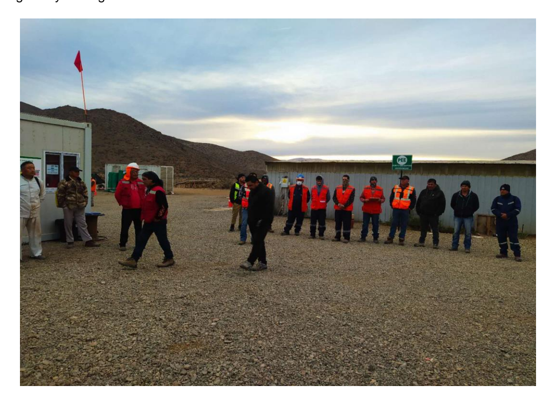
Figure 6: Employee safety briefing

The Company is maintaining a strong focus on health and safety, with regular safety briefings prior to the start of work each day (see Figure 6 below). Special attention is paid to safety equipment and on working safely at heights.