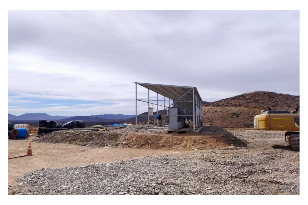
Figure 5: Power distribution room

A low-voltage power distribution room is also being assembled, together with a steel tile power distribution room.