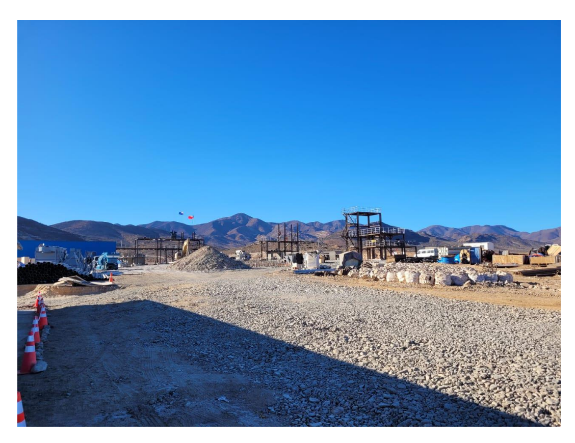
Figure 7: Process plant - panoramic view