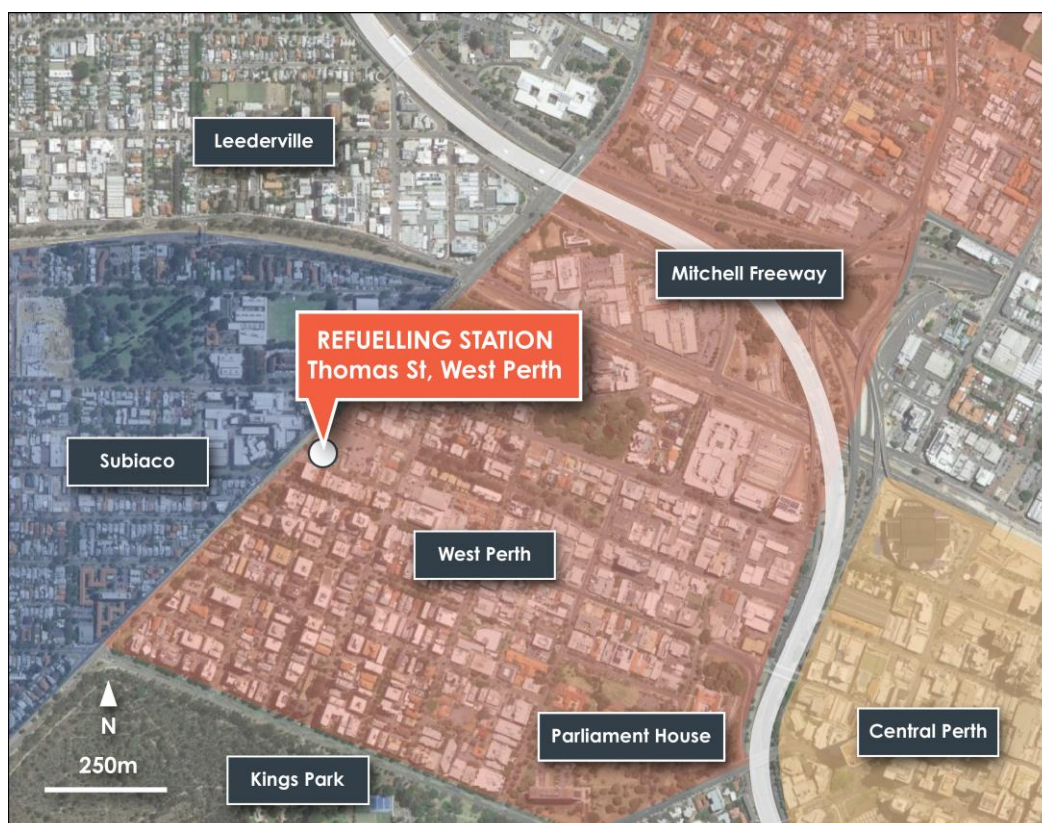
Image 1 – Map of Refuelling Station location and surrounding infrastructure

Development of this refuelling station is subject to final approvals, as well as a Final Investment Decision by Frontier.