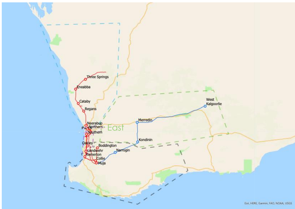
Figure 1: SWIS 330kV – 220kV network and Regions