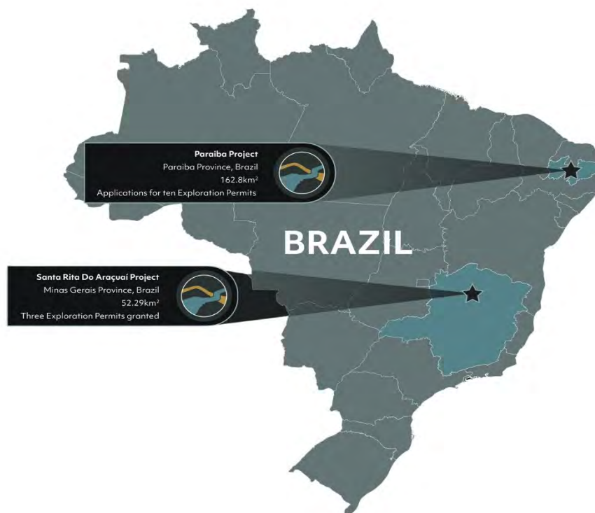
Figure 1: Project locations of Adelong's Brazil Lithium Projects

The Company is pleased that the 10 license applications in the Paraíba Province have now been granted (see ASX Announcement 4 March 2023) and expects to commence a similar reconnaissance program in the very near future and will then finalise its further plans for Brazil.