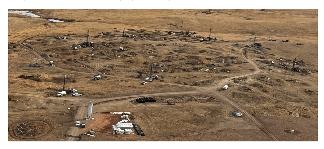
Figure 5: Aerial view of MU-3 of construction and drill rigs

The pipelines, powerlines and MU-3 wellfield surface facility construction are advancing on schedule in anticipation of the commencement of pre-production operations in Q3 2024.