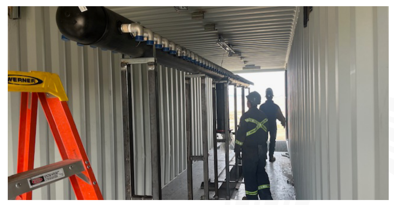
Figure 6: Installation of injection manifold at new Header House placed in MU-3