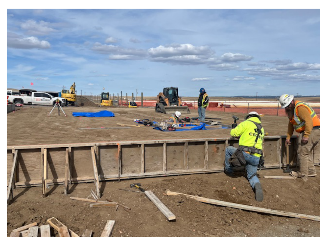
Figure 3: Preparing forms for a 250-cubic yard concrete pour (March 2024)