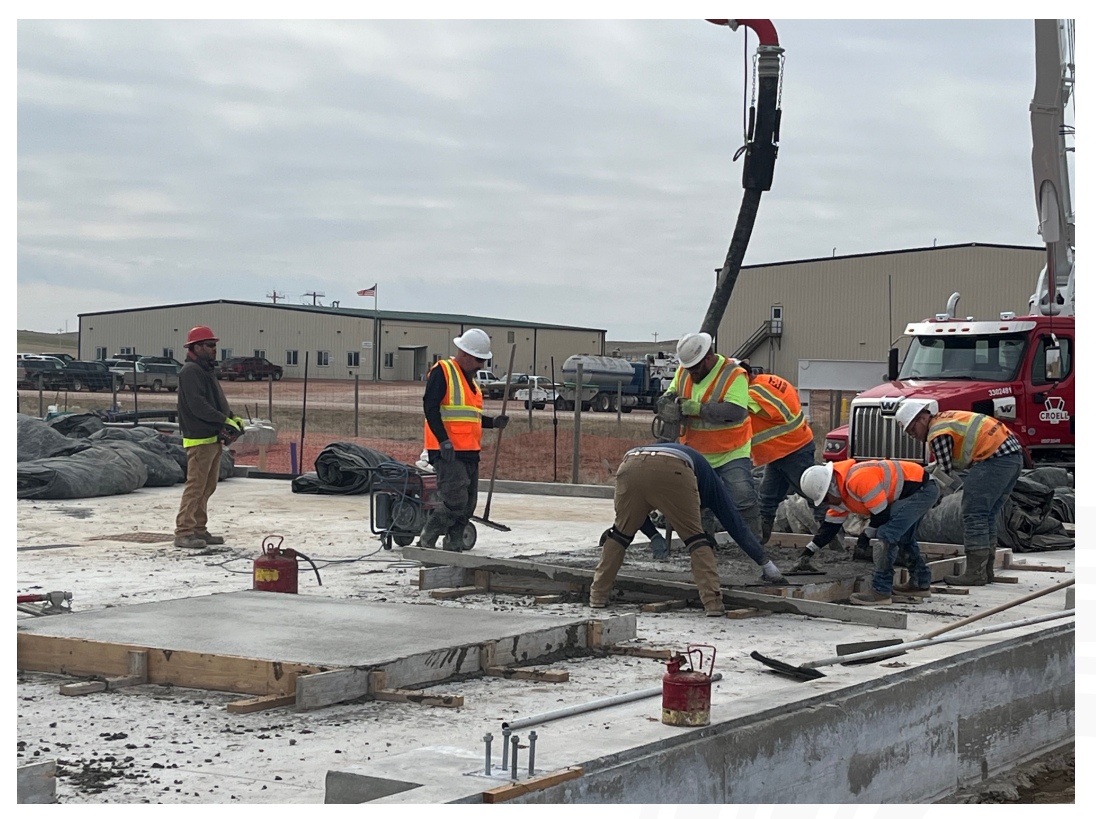
Figure 4: Foundation and tank pedestals poured for the Filtration Building (early April 2024)