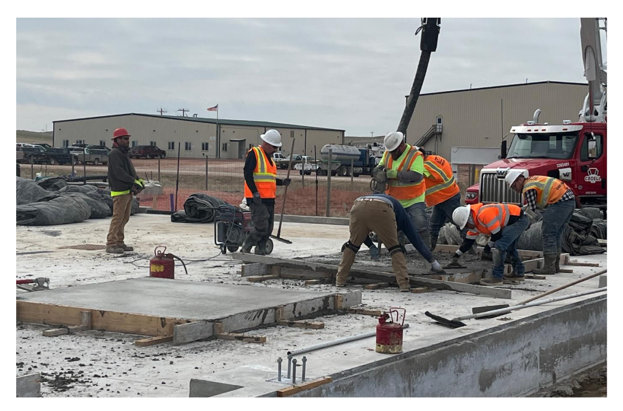
Figure 2: Foundation and tank pedestal concrete work for the filtration plant at Ross CPP