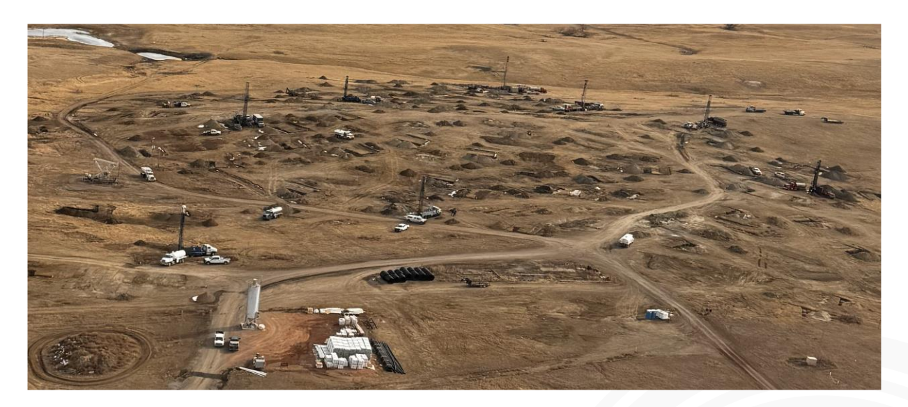
Figure 3: Arial view of MU-3 development and drill rigs