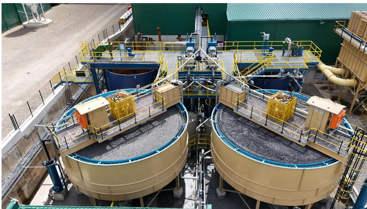
Figure 3: Vares Processing Plant