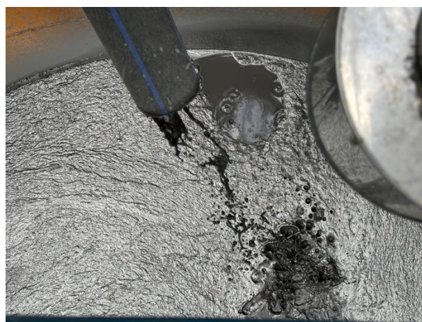
Figure 2: Processing of concentrate at the Vares Processing Plant