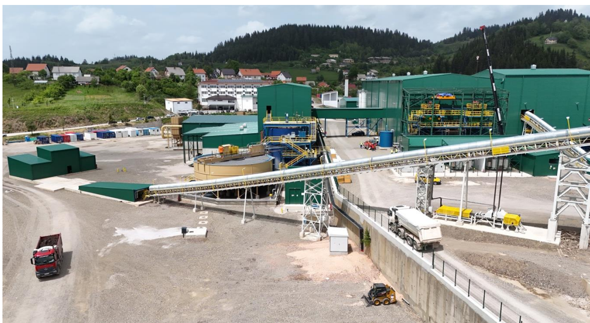
Figure 5: Vares Processing Plant