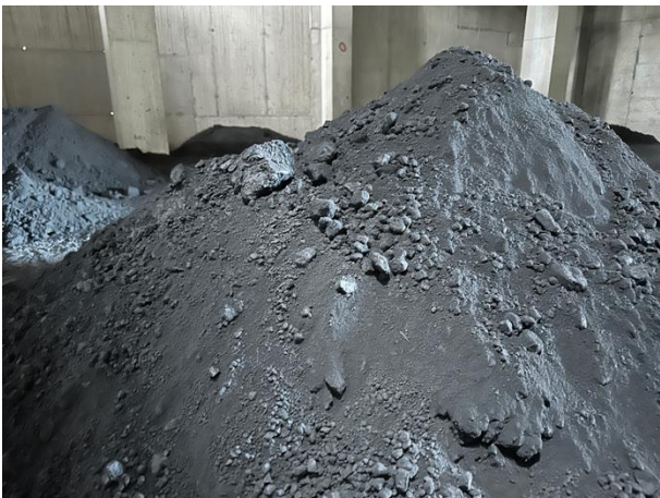
Figure 1: Processing at the Vares Processing Plant and stockpiled concentrate