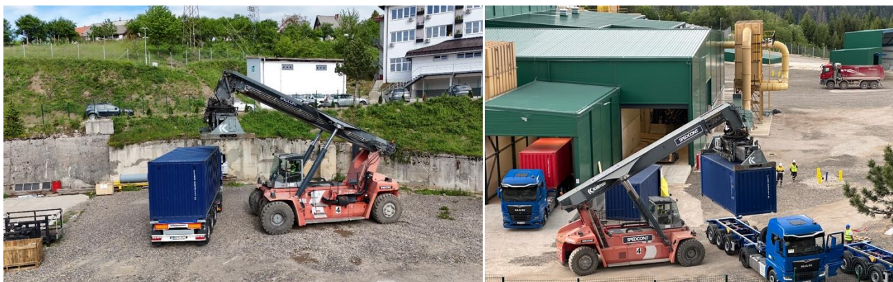
Figure 4: Loading of the concentrates onto trucks to travel to Ploce Port at the Vares Processing Plant