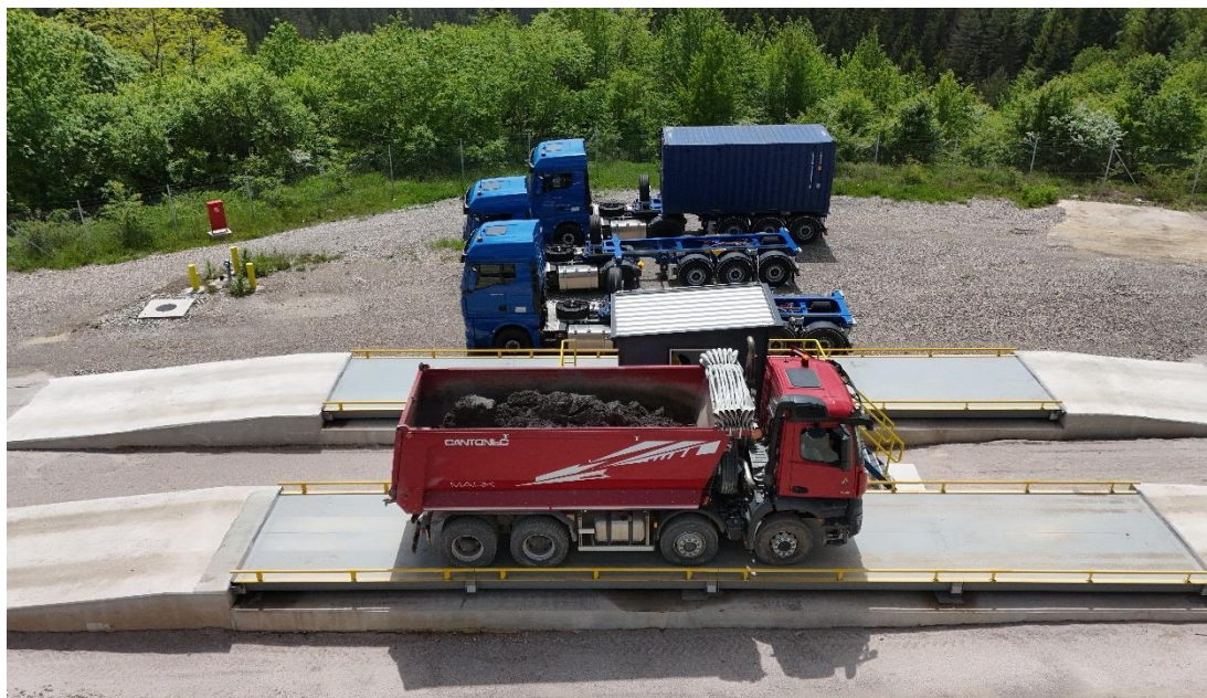
Figure 6: Weighing of trucks