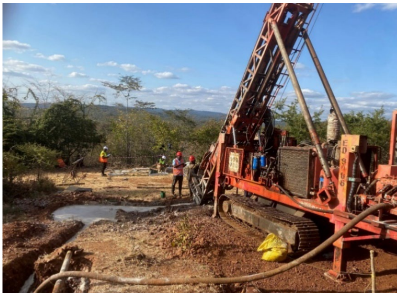
Figure 2: Drilling has commenced at the first drill target

Drilling of the first of the intended target holes (CDD004) as per Figure 2 below has been completed, with an intersection of pegmatite in evidence from 6 m to 14.45 m ( \pm 8.45 m, not true width), close to outcropping pegmatite. Sample coring ceased at 26.3m.