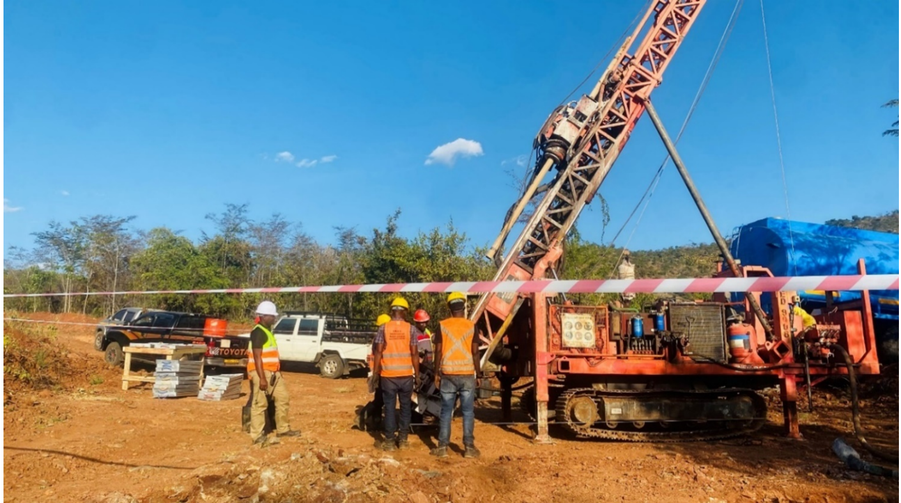
Figure 2: Drill rig onsite at the final drill hole at the Chenene Project

“We are excited to have successfully completed our initial drilling program at the Chenene Lithium Project in Tanzania. The program forms a key part of the Company’s due diligence in respect of our Option to acquire the Project. We now eagerly look forward to receiving results. The program was expanded to nine holes, and core samples are currently being progressively submitted for laboratory analysis, with results expected in the following month.”