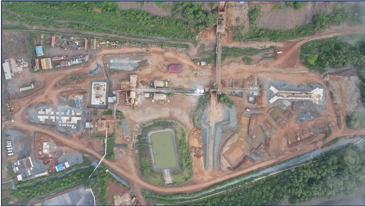
Figure 2: Aerial view of the SSCP construction area