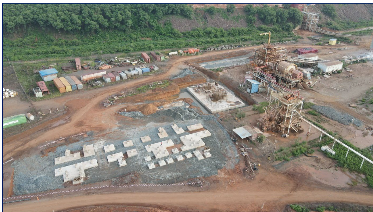
Figure 1: Ball mill and flotation area foundations

The photos below, from 17 th July, show progress on the SSCP.