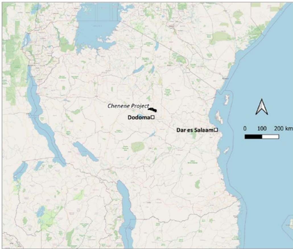
Figure 3: The Location of the Chenene Project in Tanzania