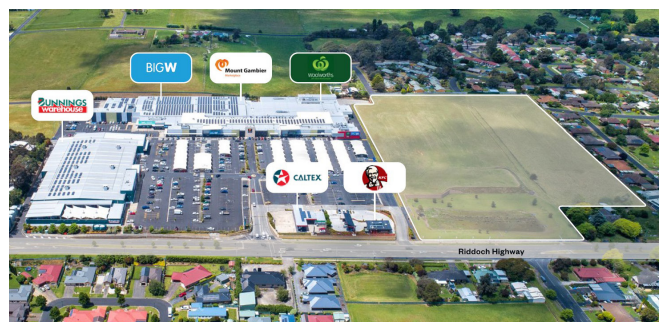
Mt Gambier, SA

Axiom agreed to conditionally purchase an opportunity from Woolworths in Mt Gambier, South Australia to develop a multi-million-dollar large format retail and mixed-use precinct. The two separate sites are adjacent to a thriving Shopping Centre (Mt Gambier Marketplace) which is anchored by a Woolworths Supermarket, Big W Discount Department Store and a Bunnings Warehouse. The Company continues to work towards obtaining all statutory approvals and achieving the pre-lease conditions prior to entering into a construction contract and settling the purchase of the site. Current leasing enquiry has been extremely encouraging, with pre-lease interest being received from many major national retailers.