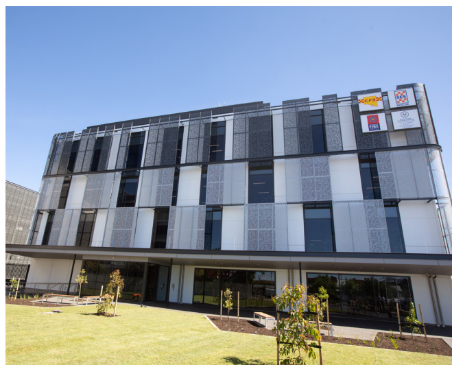
South Australian Emergency Services State Control Centre, SA

Axiom retains a development right with Charter Hall on the surplus developable land, which is capable of being developed into a 10,000 sqm (approx.) office facility, subject to a sufficient tenant pre-commitment. Under the terms of this Development Right, Axiom will be entitled to any development profit accruing from the development and Charter Hall will be responsible for providing all funding requirements of the project.