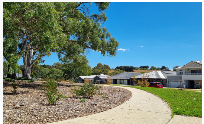
Glenlea Estate, Mt Barker

Given the current trajectory of the development and its success, the Joint Venture is considering ways in which to expedite proceeds from the development. During the 2024 financial year, the development contributed $1.5m to the Company's earnings. In addition, subsequent to year end the Joint Venture made its first distribution of surplus cash to the partners, with the Company receiving its $1m in development fee receivable. The Joint Venture will continue to distribute forecast surplus cash as it becomes available and when prudent.