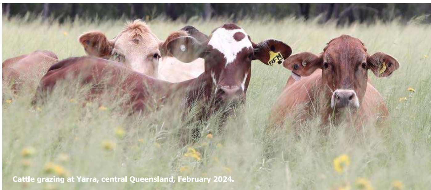
Cattle grazing at Yarra, central Queensland, February 2024.

The Audit Committee Charter is included in the Corporate Governance Charter, is available on the Responsible Entity's website.