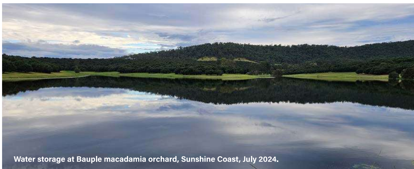
Water storage at Bauple macadamia orchard, Sunshine Coast, July 2024.

New Directors are selected and appointed in accordance with the Corporate Governance Charter. New Directors are provided with an induction relevant to the Responsible Entity and the Fund and are provided opportunities to extend their skills and knowledge, through informal and formal means.