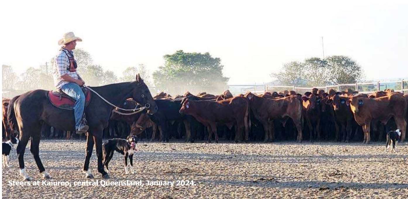
Steers at Kaiuroo, central Queensland, January 2024.

As an externally managed scheme, recommendations 9.1, 9.2 and 9.3 do not apply to the Fund.