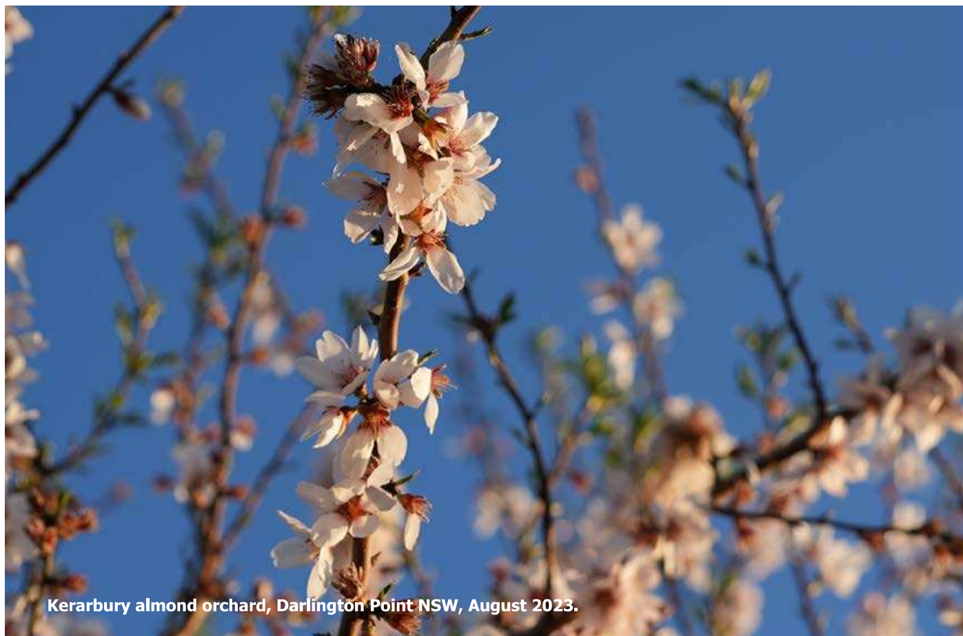
Kerarbury almond orchard, Darlington Point NSW, August 2023.

Boardroom, the Fund's registry service provider, provides the option for Unitholders to receive their communications electronically. The Responsible Entity encourages all investors to communicate electronically and provides regular correspondence advising shareholders of this option.