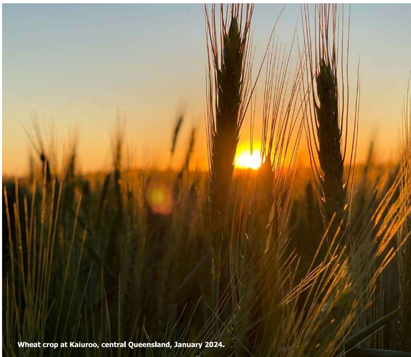
Wheat crop at Kaiuroo, central Queensland, January 2024.

All announcements released in respect of the Fund can be viewed at www.asx.com.au .