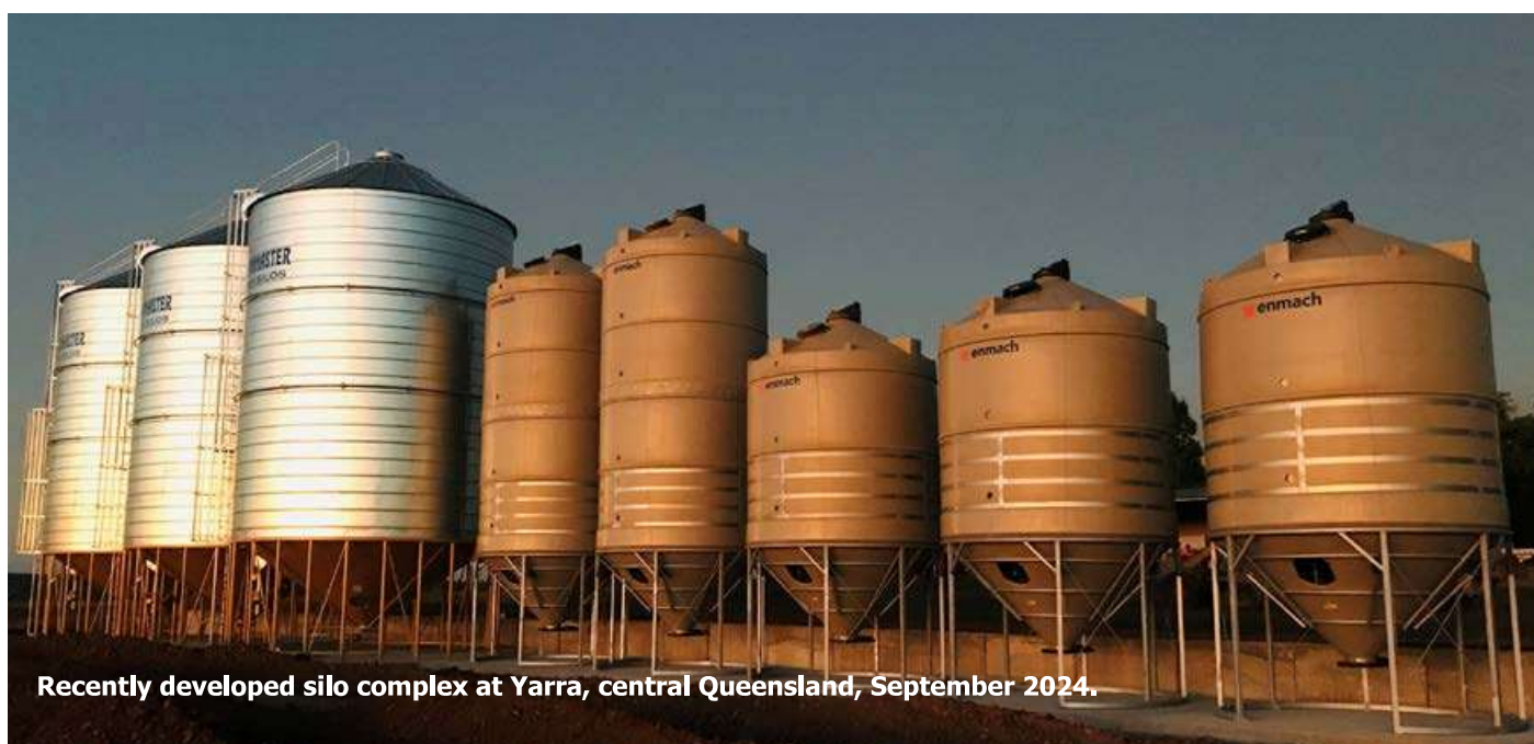
Recently developed silo complex at Yarra, central Queensland, September 2024.

The Responsible Entity's approach to managing material exposures is outlined in the RFF Annual Report 2024 . Management of environmental (including climate-related impacts) and social risks are incorporated in the entity's risk management framework. The Board is responsible for overseeing the risk management framework, with the internal management of the framework delegated to the ICC.