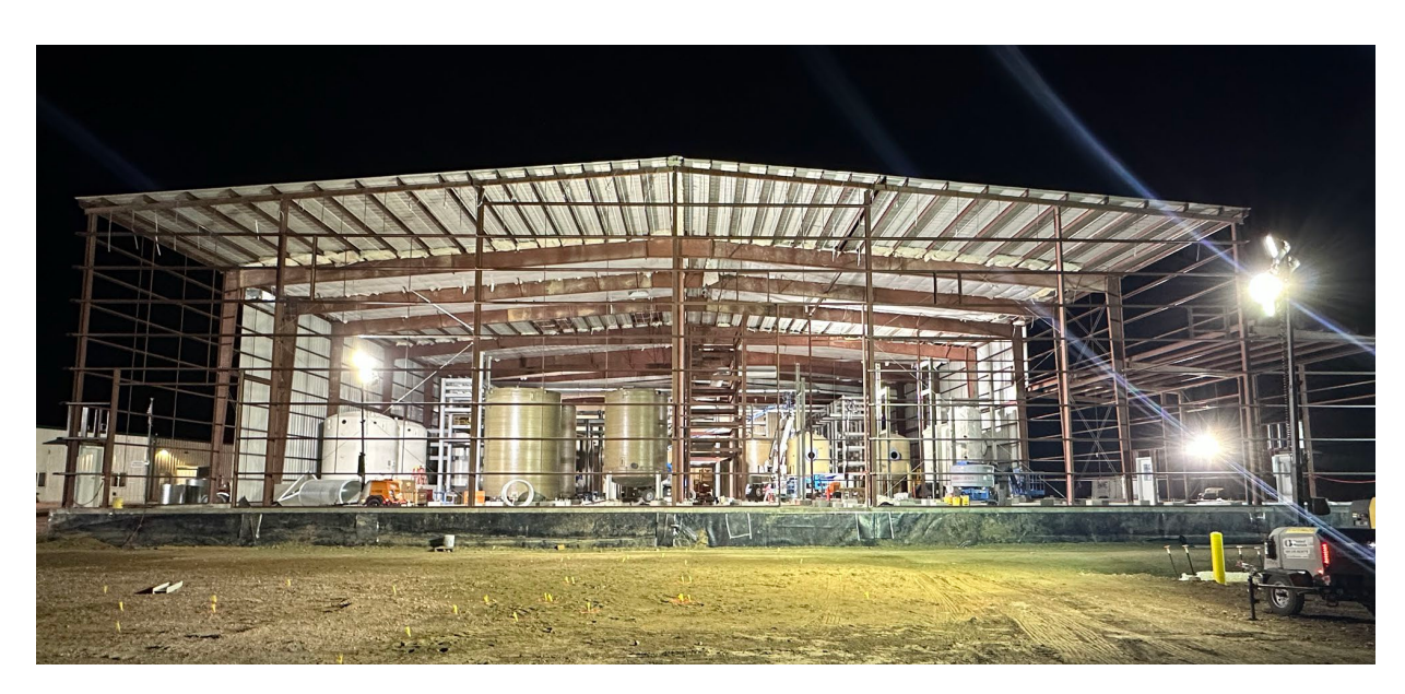
Figure 2: Lance Process Plant expansion showing interior equipment installation