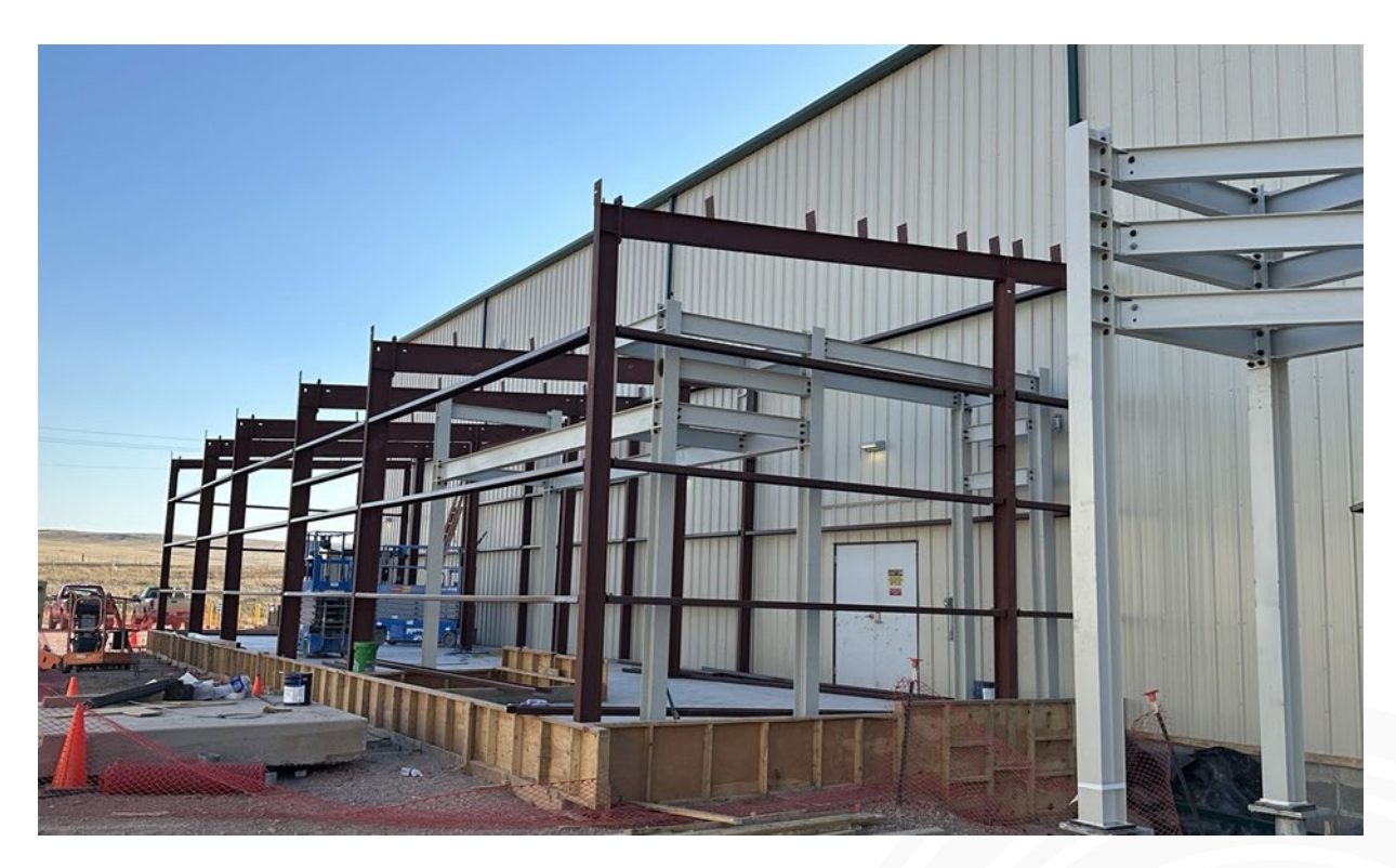
Figure 3: Progress photo of new laboratory addition to the East side of the existing Lance Plant facility