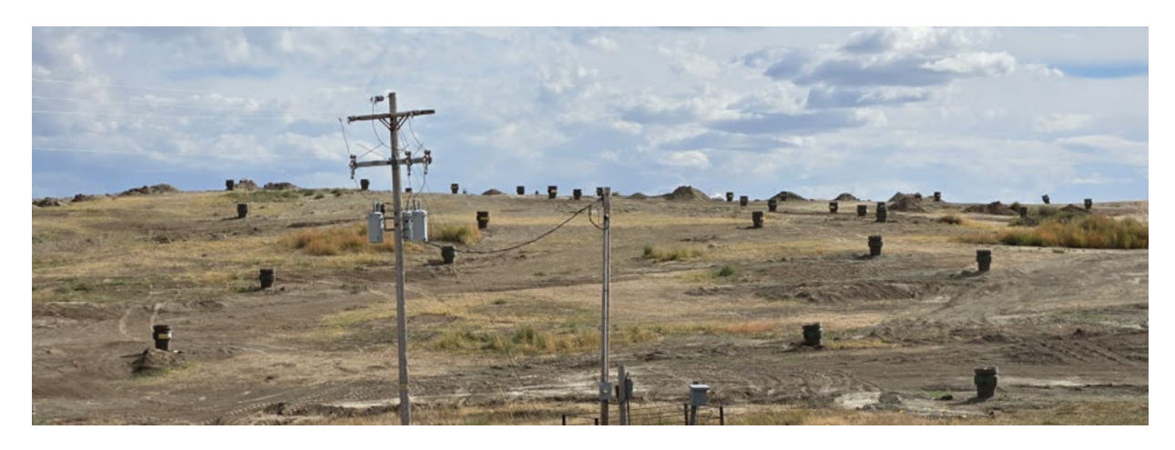
Figure 5: Newly Developed MU-3 HH-11 Wellfield Area