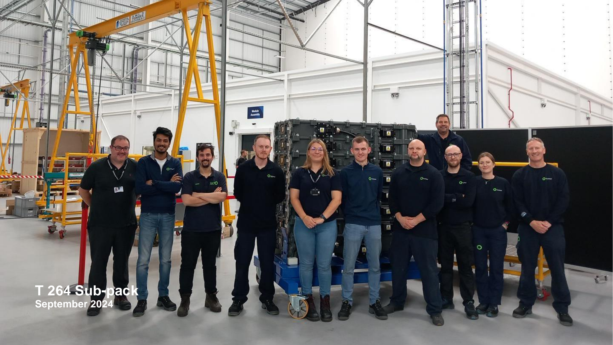
T 264 Sub-pack September 2024