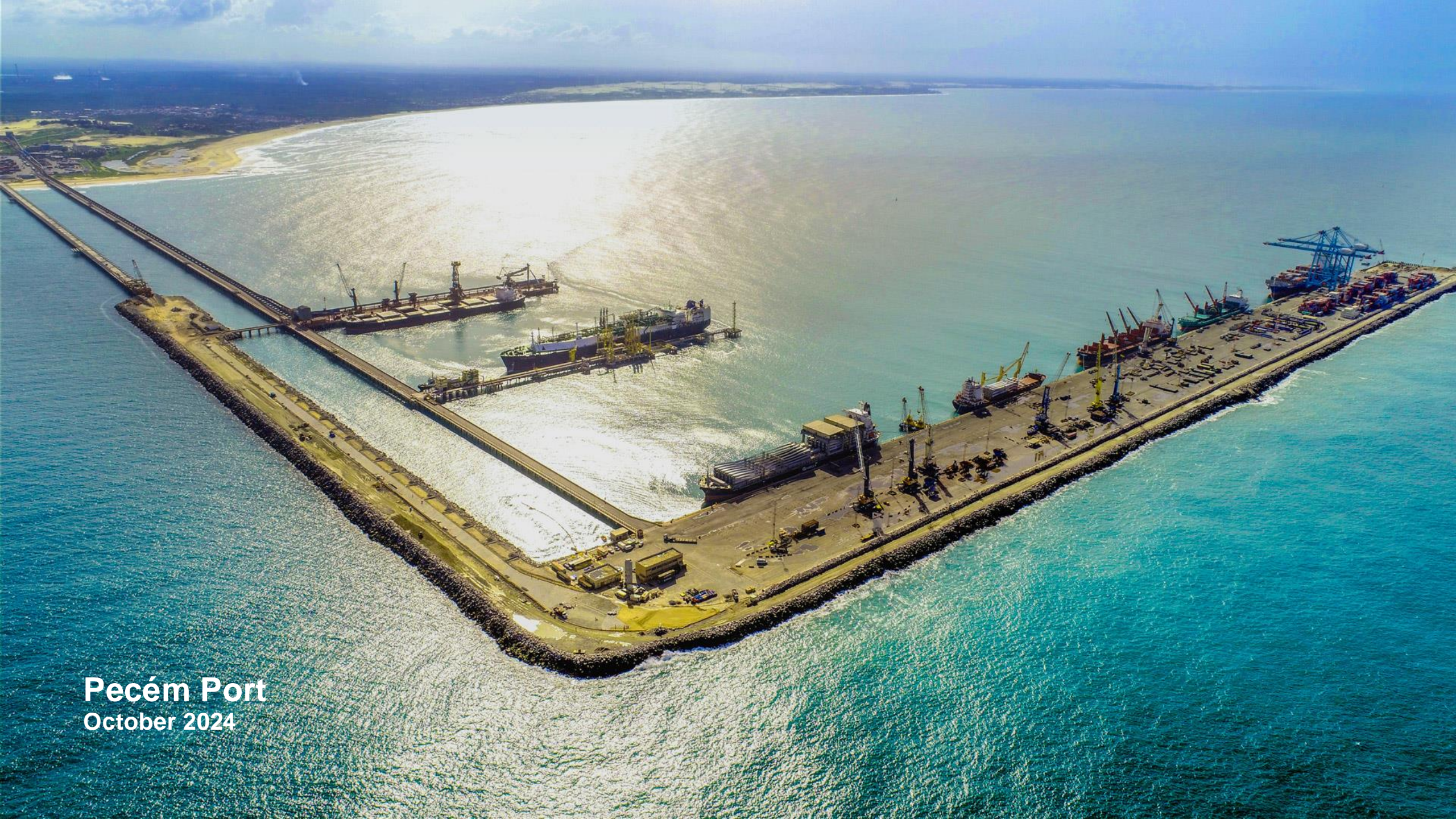
Pecém Port October 2024