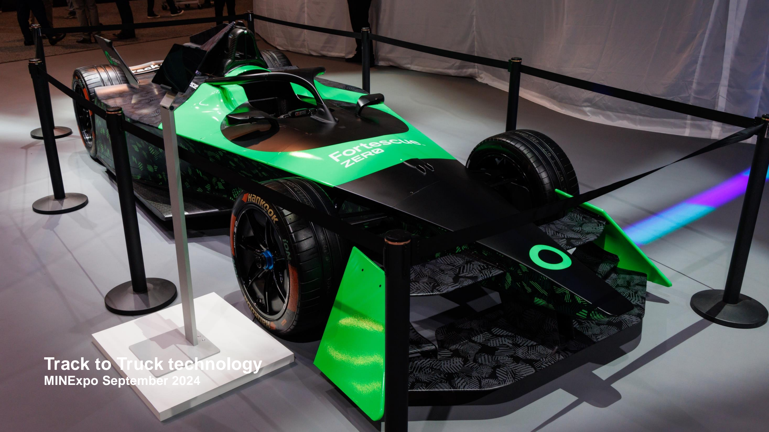
Track to Truck technology MINExpo September 2024