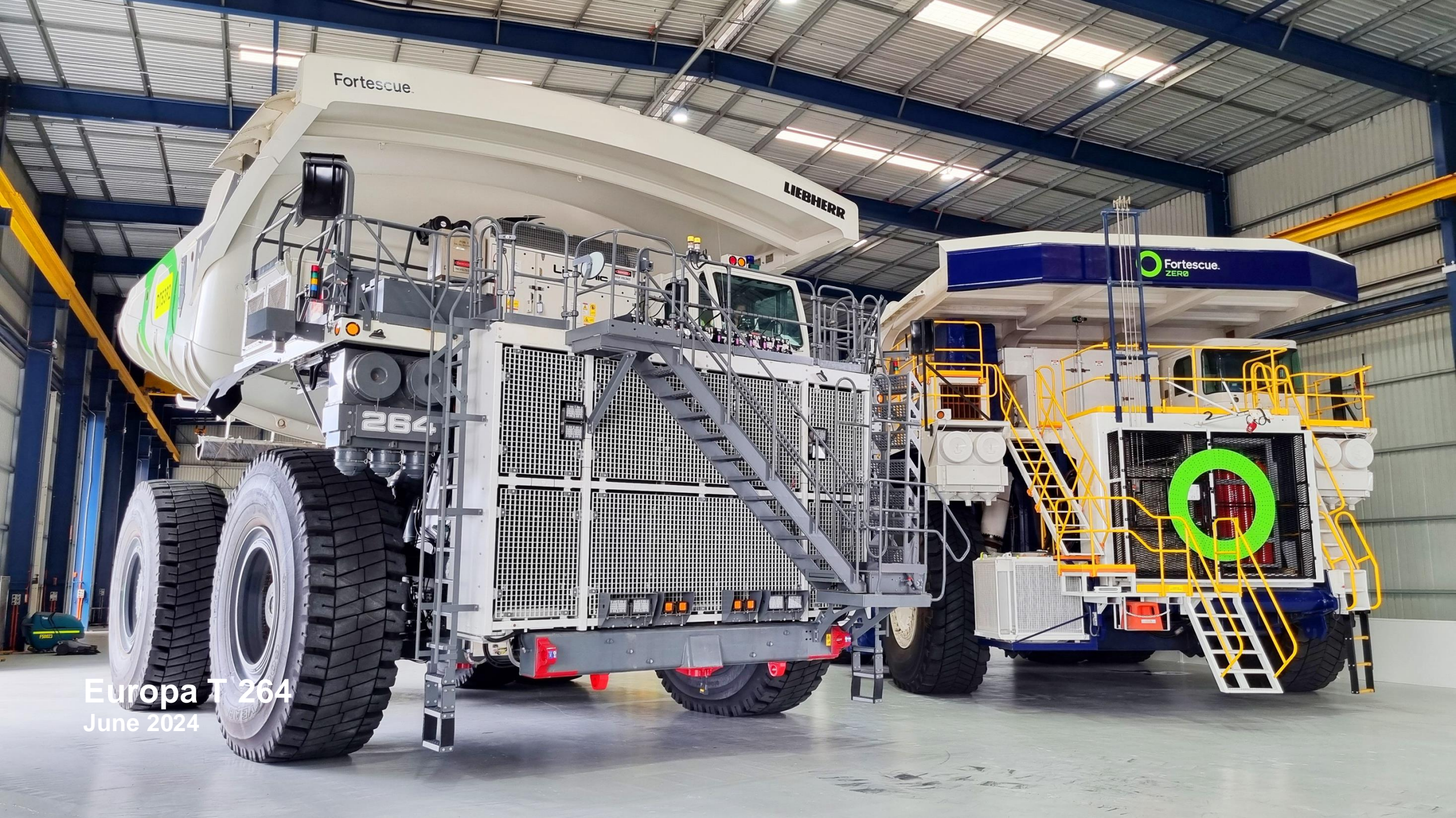
Europa T 264 June 2024