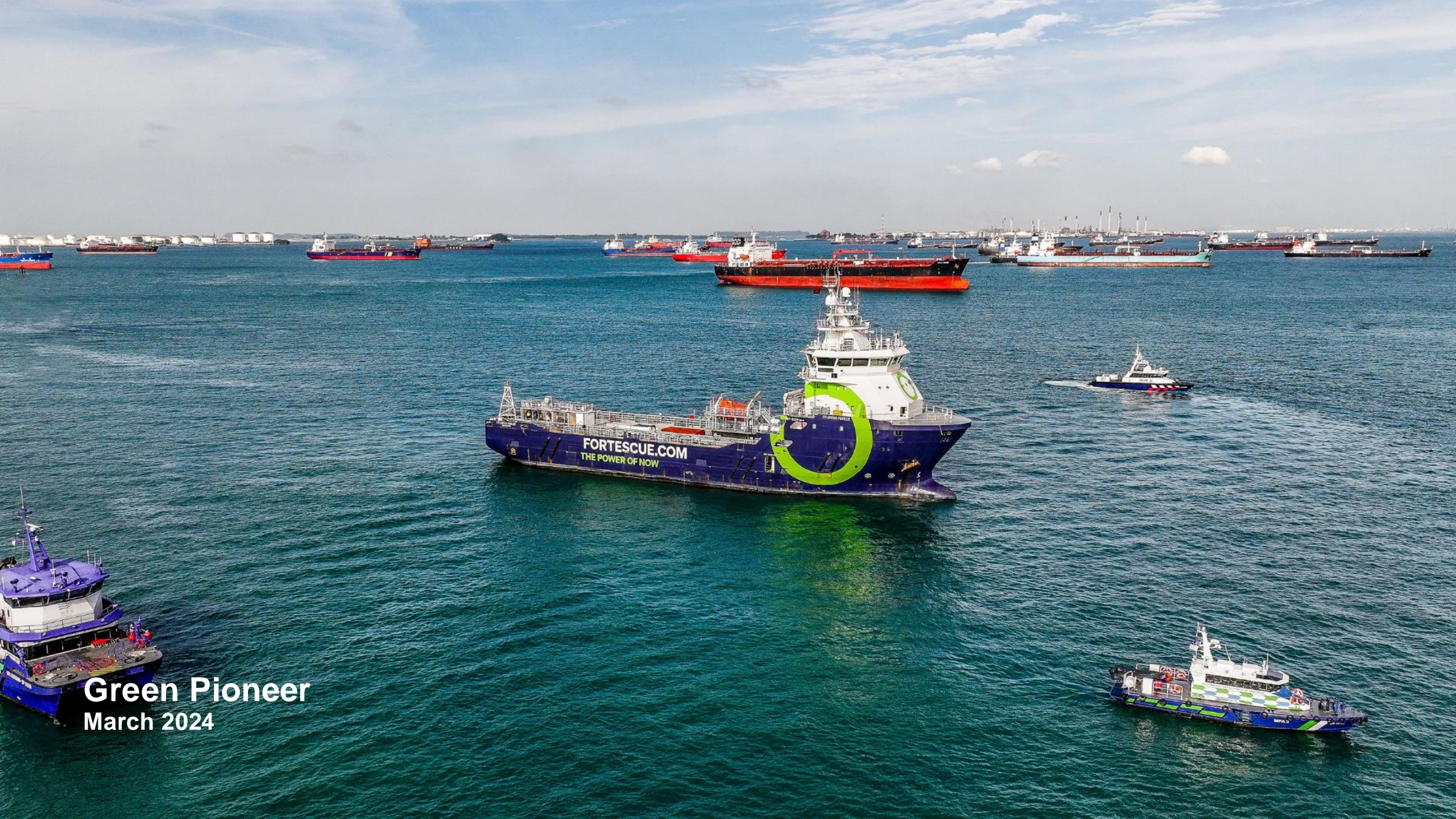
Green Pioneer March 2024