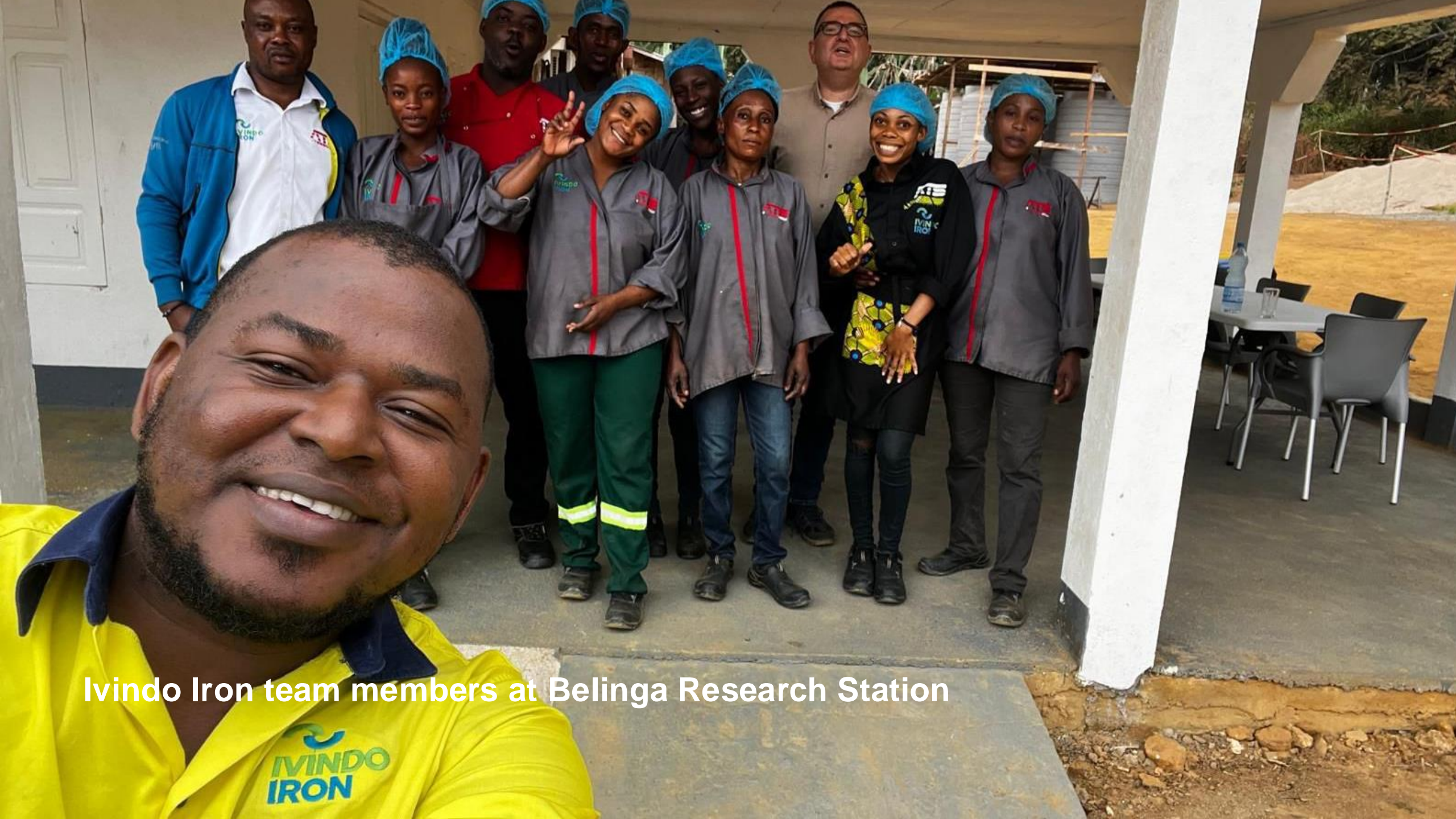
Ivindo Iron team members at Belinga Research Station