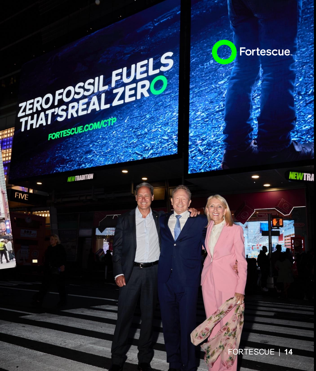
Times Square, September 2024