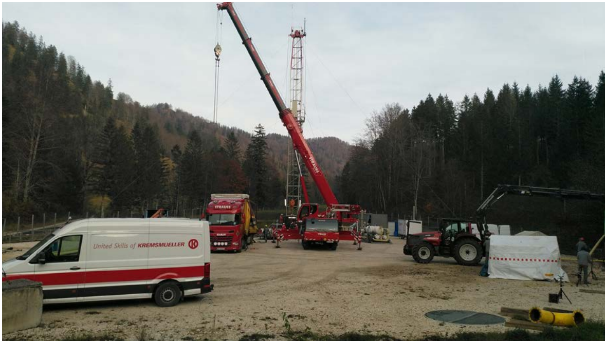
Figure 2: Initial Rig up of workover rig W-102 from RED Drilling & Services at the Welchau-1 well location together with set up of the Flow Testing Facilities