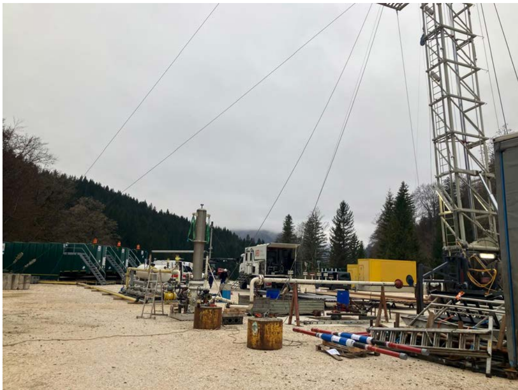
Figure 3: Well completion work and Flow Testing Facilities set up at the Welchau-1 well location in preparation for flow testing the well