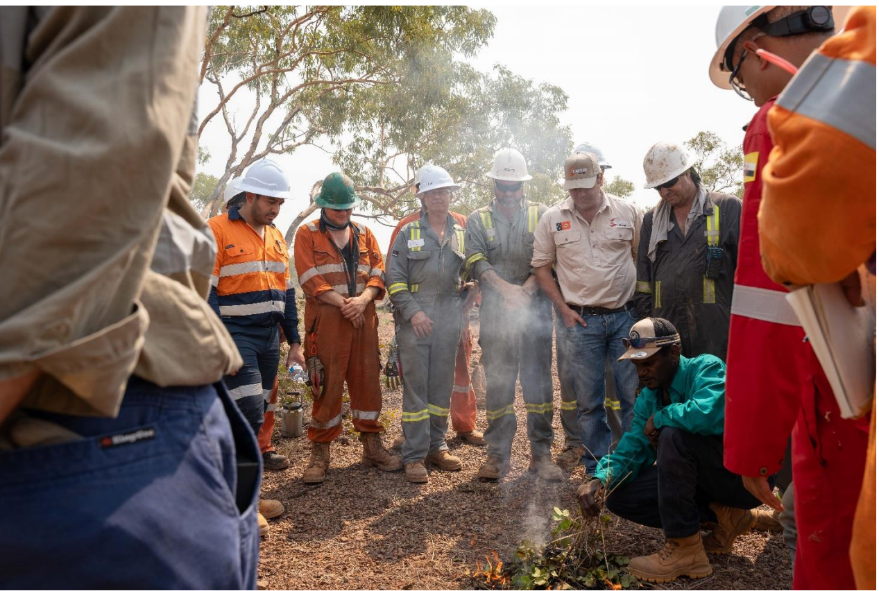
Smoking ceremony conducted by traditional owners at the Carpentaria-5H well site

As announced to the ASX on Friday 15<sup>th</sup> November, Empire is working with the Northern Land Council to facilitate an on-country meeting with traditional owners to seek their consent for the sale of gas under the Beneficial Use of Test Gas provisions of the NT Petroleum Act. This decision meeting will follow consultation meetings with traditional owners that occurred in August 2024.