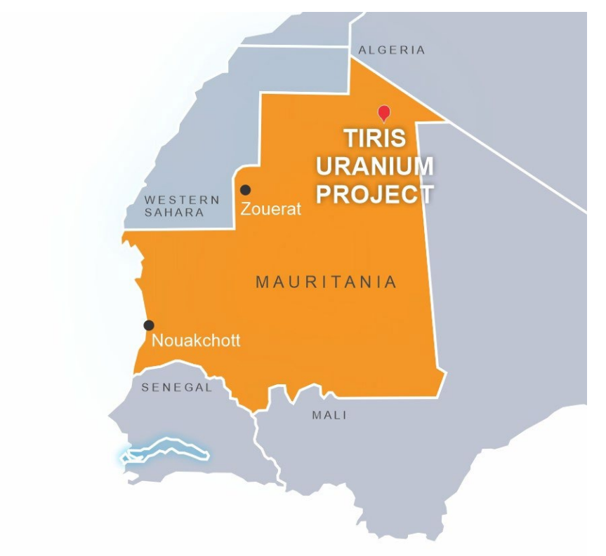
Figure 2: Location plan of the Tiris Uranium project in Mauritania, Africa

Tiris is located approximately 1,400 kilometres from the capital of Mauritania, Nouakchott. The Project is located 680km from the town of Zouérat in the Tiris Zemmour Region of Mauritania. Access is by hard pan desert track (Figure 2).