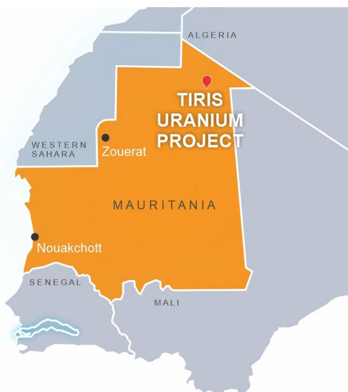
Figure 2: Location plan of the Tiris Uranium project in Mauritania, Africa

Tiris is located approximately 1,400 kilometres from the capital of Mauritania, Nouakchott. The Project is located 680km from the town of Zouérat in the Tiris Zemmour Region of Mauritania. Access is by hard pan desert track (Figure 2).