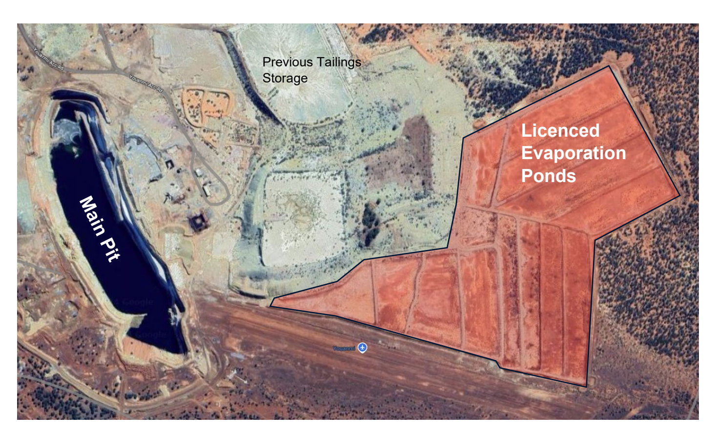
Figure 2: Plan view showing the location of dewatering infrastructure.

Works are well advanced on early dewatering with tenders received for the minor refurbishment works on the fully permitted evaporation ponds, along with quotes on the pumping infrastructure requirements. Environmental works have commenced to seek permitting for dewatering to the northern pits, accelerating the opportunity to access the lower areas of the main pit and the previous underground workings.