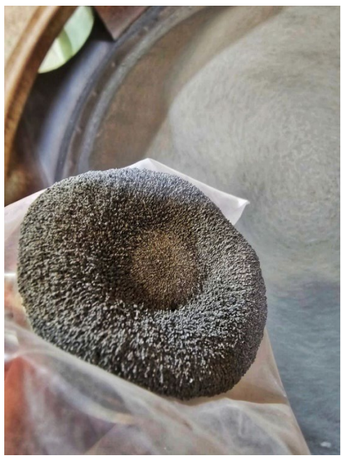
Figure 4: Magnetically separated HIO product