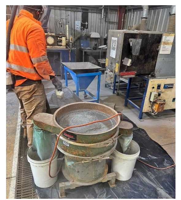
Figure 3: Screening of crushed material