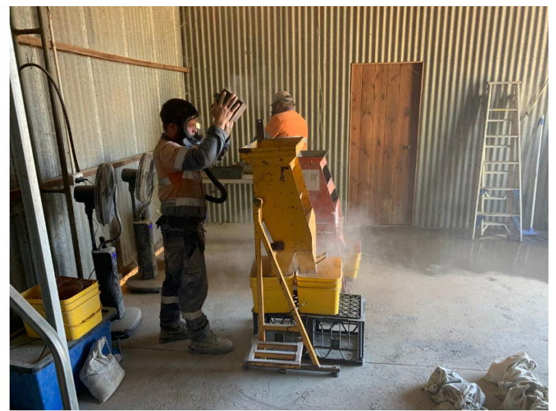
Figure 5: Sample preparation for XRD work undertaken at HIO office/yard in Broken Hill