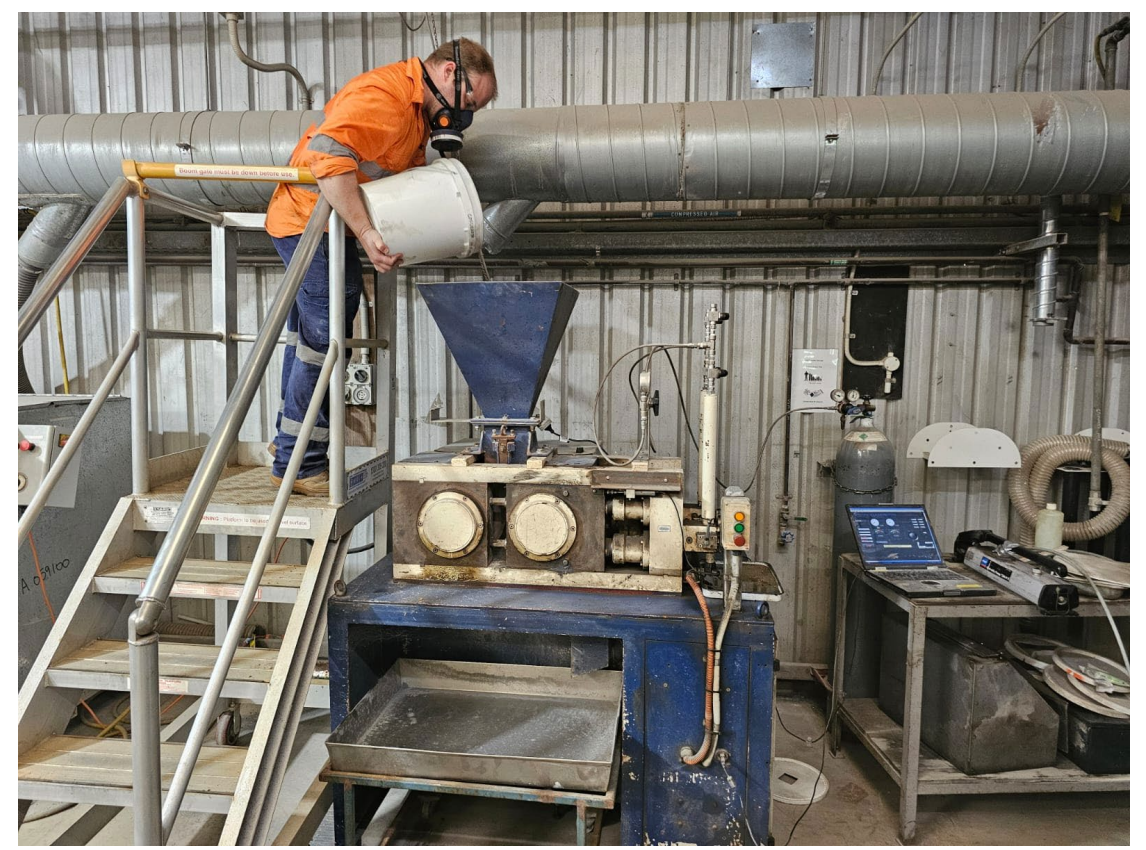
Figure 1: Comminution test work program recently completed at the University of Queensland's JKTech Centre

The aim of the dry grinding circuit test work program is to prove the ability to implement a 100% dry processing circuit for the Project. The program is well underway with initial results being highly encouraging. This dry grinding approach is unique to Hawsons because of the distinctive geochemical and physical properties that exist with the Hawsons material, a key differentiator against current Australian magnetite producers.