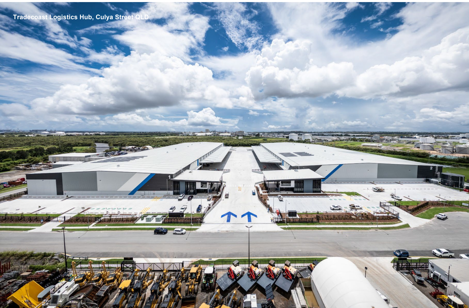
Tradecoast Logistics Hub, Culya Street QLD

Comprising the stapling of ordinary shares in Charter Hall Limited (ACN 113 531 150) and units in the Charter Hall Property Trust (ARSN 113 339 147)