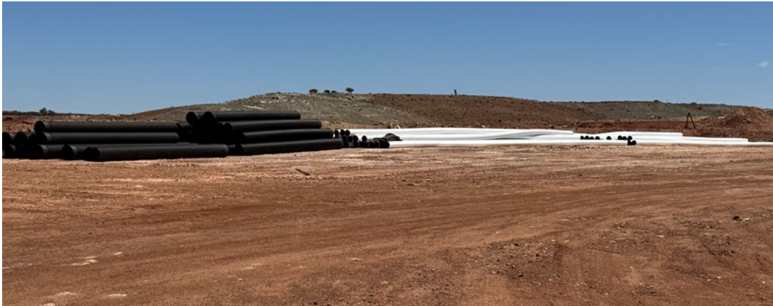
Figure 4: Dewatering pipes ready for installation to pump water from the Main pit to the evaporation ponds