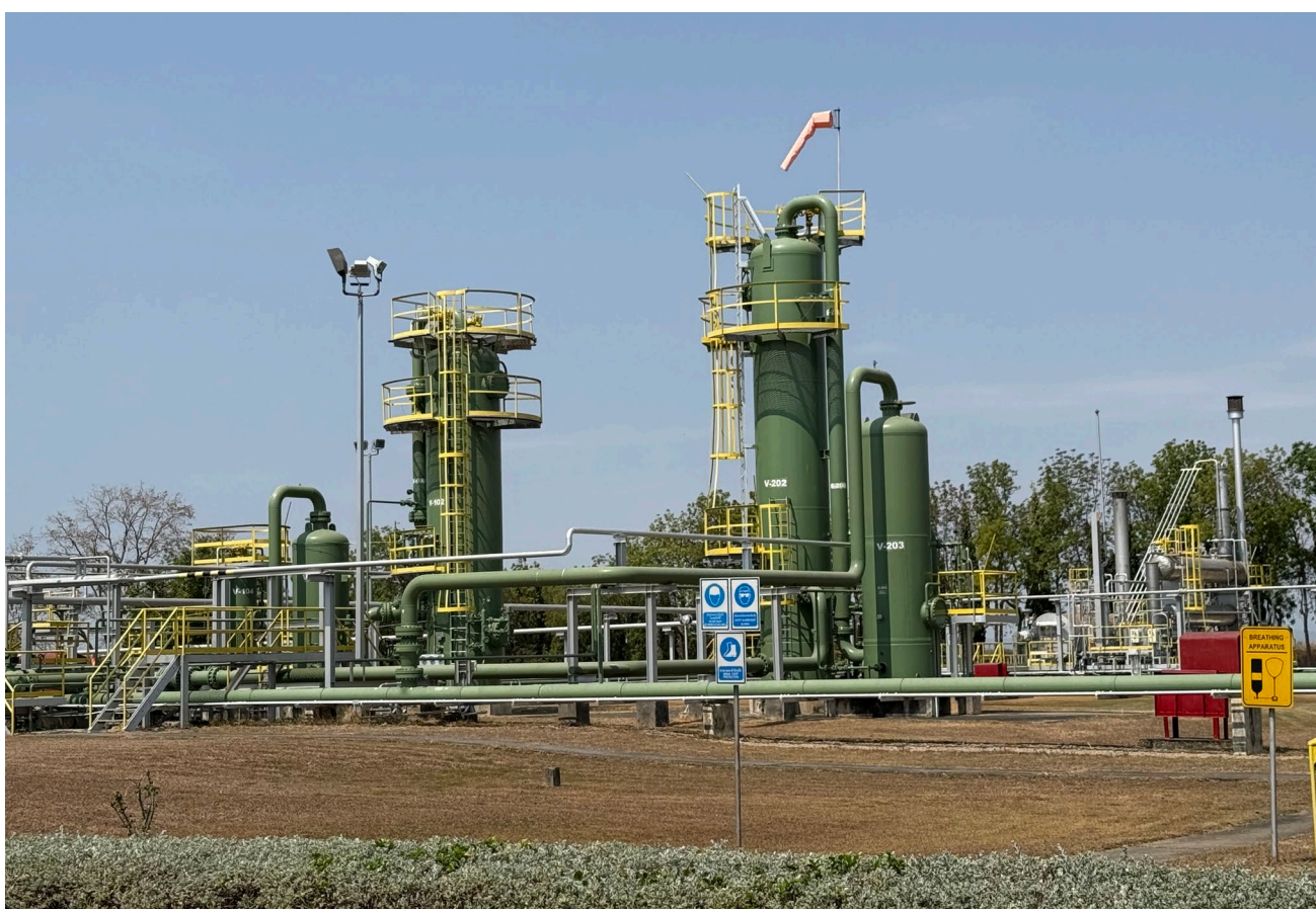
Figure 3 – Nam Phong Gas Processing Plant

Horizon estimates that at 1 January 2025, the field contains gross 2P Sales Gas reserves of 13.9 PJ [13.3 bcf] [Horizon net 8.3 PJ].