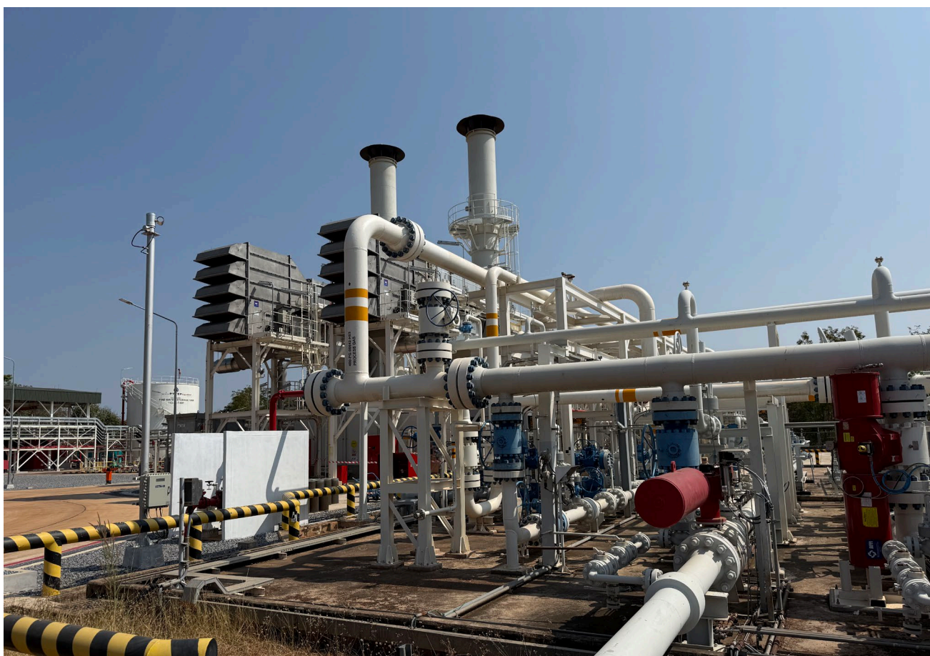
Figure 2 – Sinphuhorm Gas Booster Compressor

A gas compression project at the field in 2024 successfully increased gas production rates. Horizon estimates that at the 1 January 2025 effective date, the field contained gross 2P Sales Gas reserves of 187.1 PJ [179.5 bcf] and 0.2 MMbbl of condensate [Horizon net 14.04 PJ Sales Gas and 0.02 MMbbls condensate].