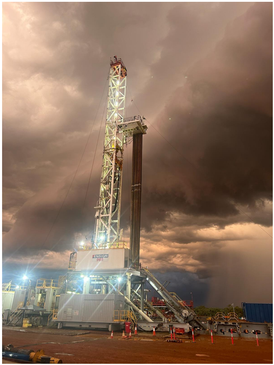
Carpentaria C-5H Ensign drill rig on location in EP187