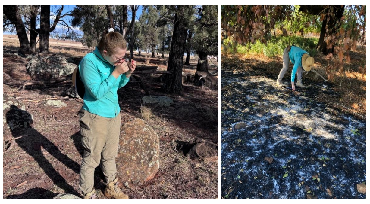
Figure 3: Contract Geologist inspecting rock chips in the field at Parkvale South Prospect