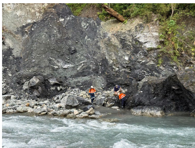
Figures 1 & 2 – Tivan's geology team members, Sohi River, 25 June 2025