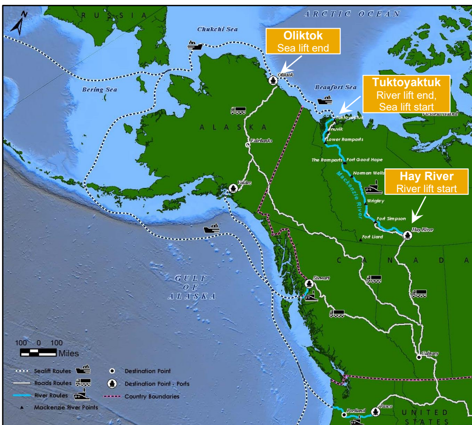
Transit route of processing modules by barge from Hay River Marine Terminal to Oliktok, Alaska