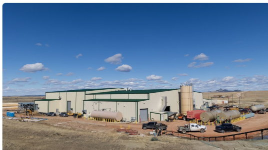
Central Processing Plant (Phase I & II)