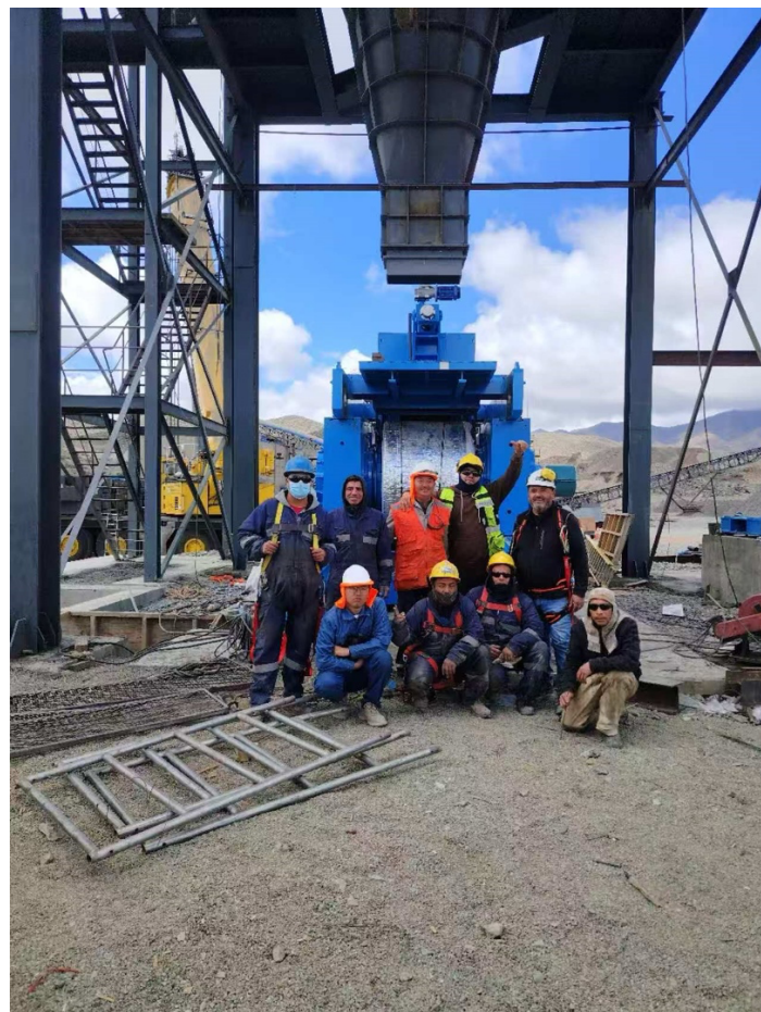
Figure 3: Mariposa workers in front of the new roller crusher