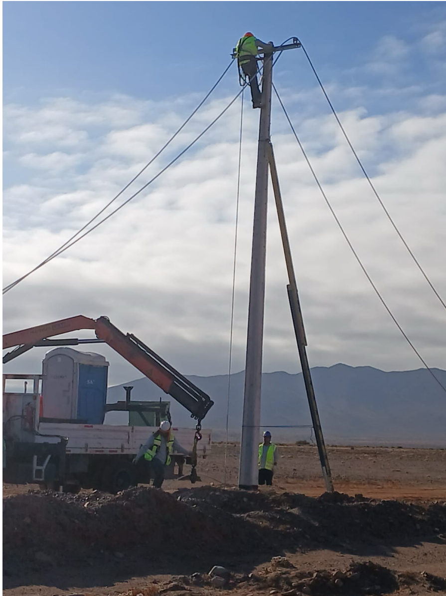
Figure 4: Cable installation at the new 23 kv transmission line