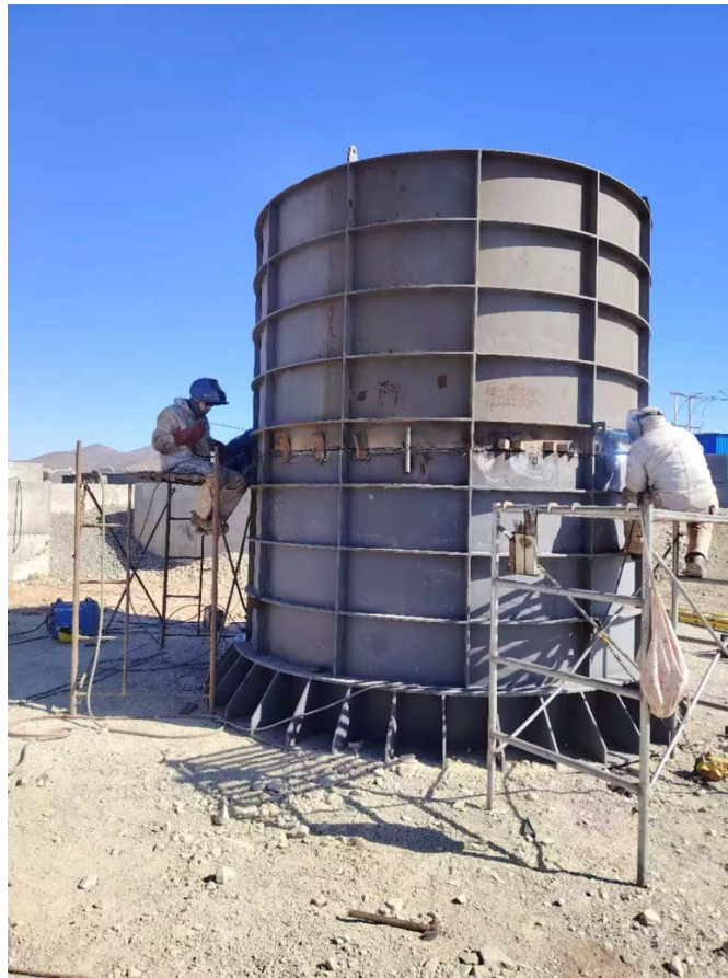
Figure 2: Construction of equipment for the new roller crusher