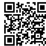
Scan QR Code using smartphone QR Reader App

PLEASE NOTE: For security reasons it is important you keep the above information confidential.