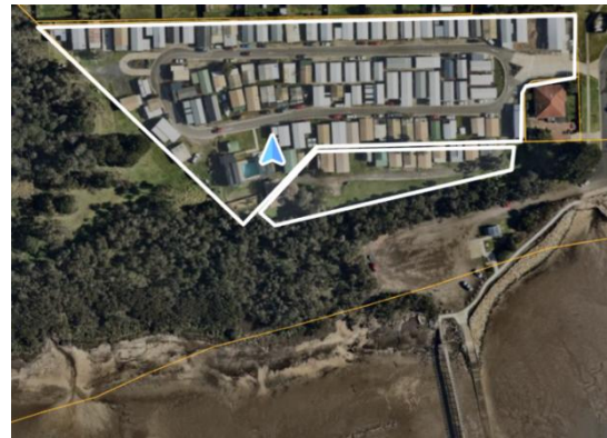
Frenchview Lifestyle Park (1.7ha site)