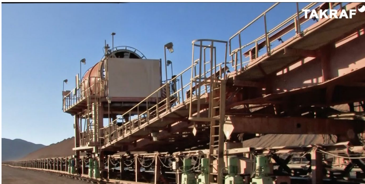
Image 1: Long conveying systems designed and installed by Takraf

The study is planned to be completed in May and, subject to final review by Hawsons, findings announced to the ASX thereafter.